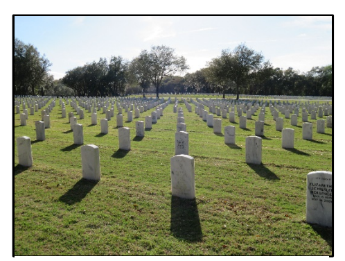
Florida National Cemetery in Bushnell, Florida is one of the 131 national cemeteries managed by the NCA.

The Veterans Benefits Administration helps to organize and deliver many kinds of financial benefits to servicemembers, veterans and their families. These benefits include compensation and pension services, educational benefits, assistance with post-service employment, and guaranteeing home and business loans.