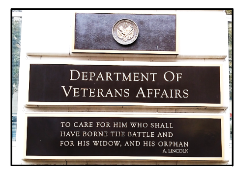
The Department of Veteran Affairs motto.

The Department of Veterans Affairs (VA) is the second largest department in the Executive Branch. Over 340,000 employees work to carry out federal laws by creating and