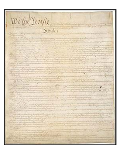
The United States Constitution

The United States Constitution is the document that sets up the federal , or national, government like a tree with three branches - the legislative branch, the executive branch and the judicial branch. The Constitution separates three main powers of government between the three branches. Congress is the legislative branch and their main power is to make the laws. The President is in charge of the executive branch whose main power is to enforce , or carry out, the laws that Congress makes. Lastly, the Supreme Court of the United States is in charge of the judicial branch. The main power of the judicial branch is to interpret the law, or to