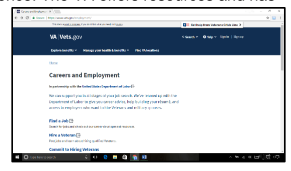
The Veteran's Employment Center website where veterans can search for a job.

Many veterans and their families apply for loans through the VBA to help them buy a home or start a business. Loans are amounts of money that a person borrows from a bank and must pay back with interest , or extra. Banks are more willing to give loans to veterans because a VA loan is guaranteed by the government. If the veteran cannot make payments on the loan, the government