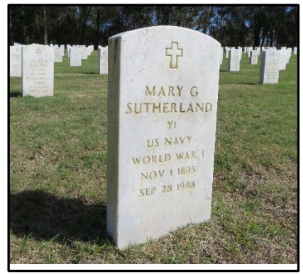
A headstone in Florida National Cemetery.

Through the NCA, the VA can provide a government headstone, marker or medallion for deceased veterans. These services must be ordered by cemetery officials based on requests by families. These services will be provided without cost to the family. Families can request a government headstone or marker for the unmarked grave of any deceased eligible Veteran in any cemetery around the world, no matter when the veteran died. Flat markers are usually made of granite, marble, and bronze while the upright headstones are either granite and marble. Bronze niche markers are also used to mark the site of cremated remains.