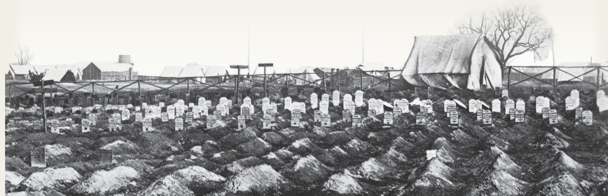
Soldiers' graves near General Hospital, City Point, Va., c. 1863.

On September 11, 1861, the War Department directed commanding officers to keep “accurate and permanent records of deceased soldiers.” It also required the U.S. Army Quartermaster General, the office responsible for administering to the needs of troops in life and in death, to mark each grave with a headboard. A few months later, the department mandated interment of the dead in graves marked with numbered headboards, recorded in a register.