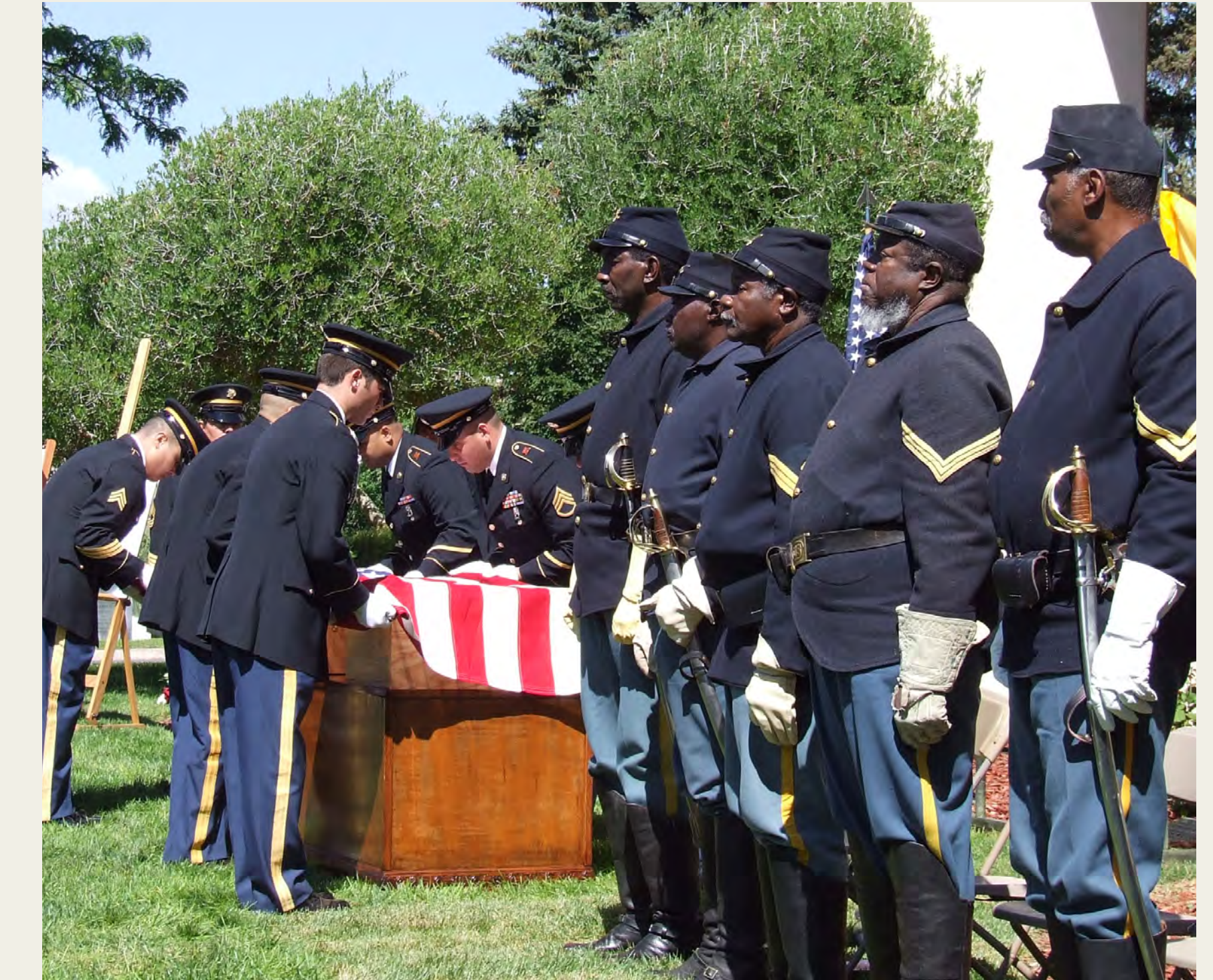
Remains of soldiers and civilians recovered from the site of Fort Craig were reinterred here in 2009. National Cemetery Administration.