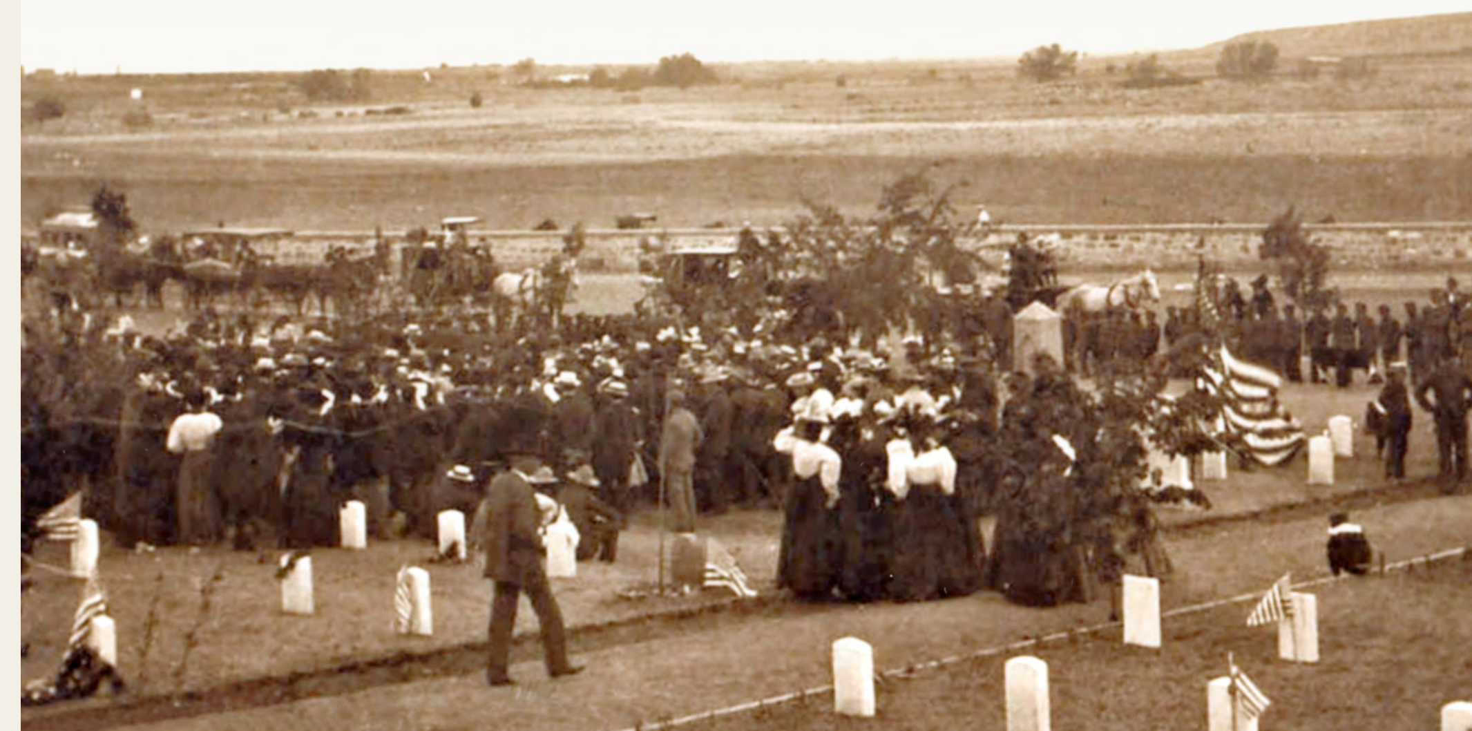
Memorial Day, 1898.

The stone Victorian-style superintendent's lodge, stable, and tool house were completed in 1895. A stone wall was built to enclose the property. In the twentieth century, the Works Progress Administration was responsible for transforming the appearance of the lodge to blend into the regional Adobe-style architecture. Laborers also improved cemetery roads and walks. In 1944, an Adobe-style garage, utility building, and rostrum were completed.