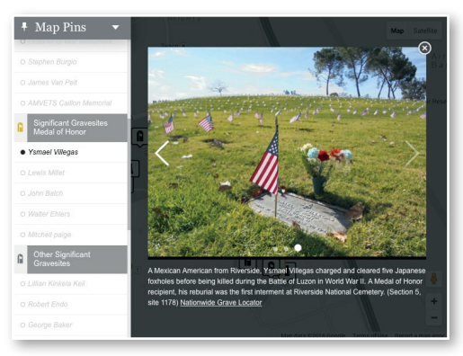
The can be a virtual tour of the cemetery: Click on a map pin icon to view historical facts and slide shows.