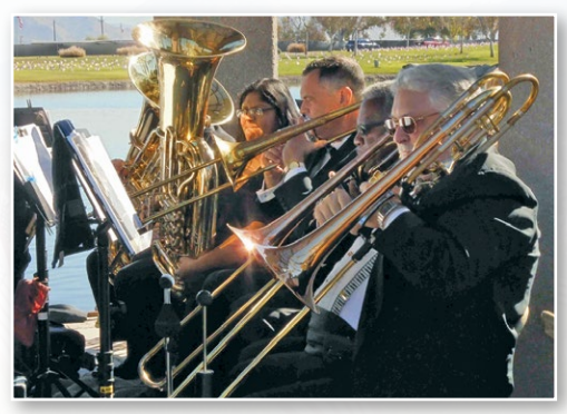
Riverside National Cemetery, Veterans Day 2015