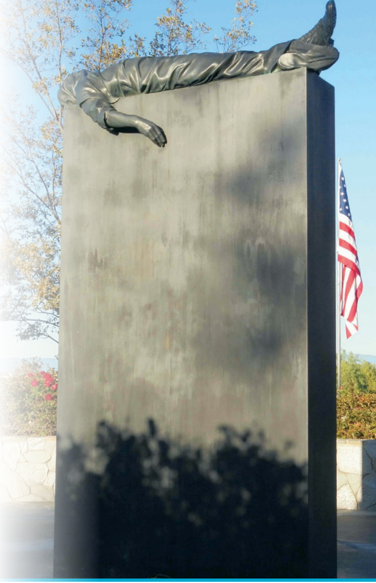
Veterans Memorial, Riverside