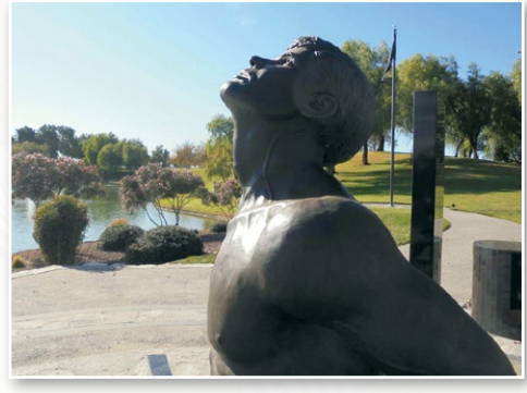
POW/MIA Memorial, Lake A, Riverside

Surrounded by distant mountains, Riverside National Cemetery's central boulevard winds past lakes, memorial circles, and grand monuments. Unlike older cemeteries with upright headstones, its flat markers and vast lawns reflect the design of a modern memorial park cemetery. Riverside opened in 1978 on land that had served as Camp Haan during World War II. Its Veterans Day and Memorial Day programs have attracted thousands annually to its Veterans Memorial Amphitheater. Riverside is the third-largest cemetery managed by the National Cemetery Administration. Since 2000, it has been the system's most active cemetery.