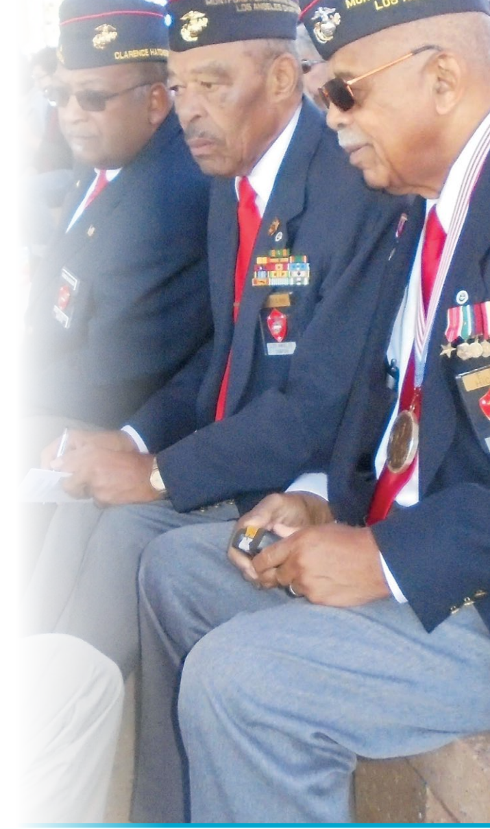
Montford Point Veterans