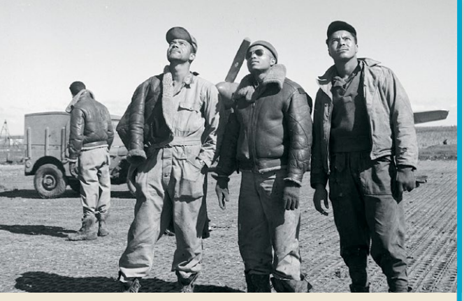
Tuskegee Airmen Ground Crew. Ramitelli, Italy, March 1945.