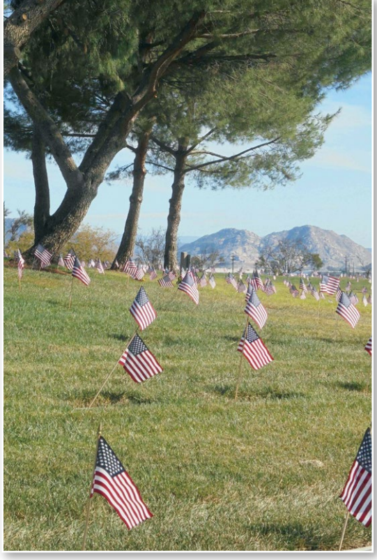
Veterans Day Flags