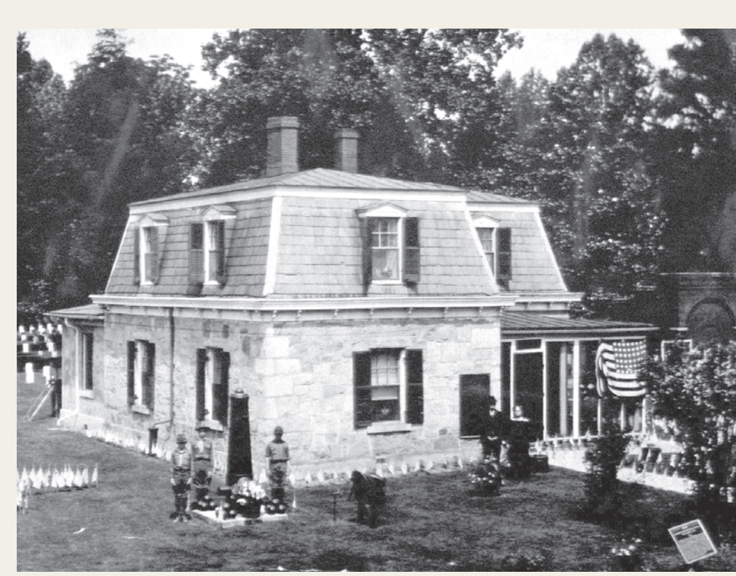
Lodge at City Point, Va., pre-1928. The first floor contained a cemetery office, and living room and kitchen for the superintendent's family; three bedrooms were upstairs.

Most cemeteries were less than 10 acres, and layouts varied. In the Act to Establish and to Protect National Cemeteries of February 22, 1867, Congress funded new permanent walls or fences, grave markers, and lodges for cemetery superintendents.