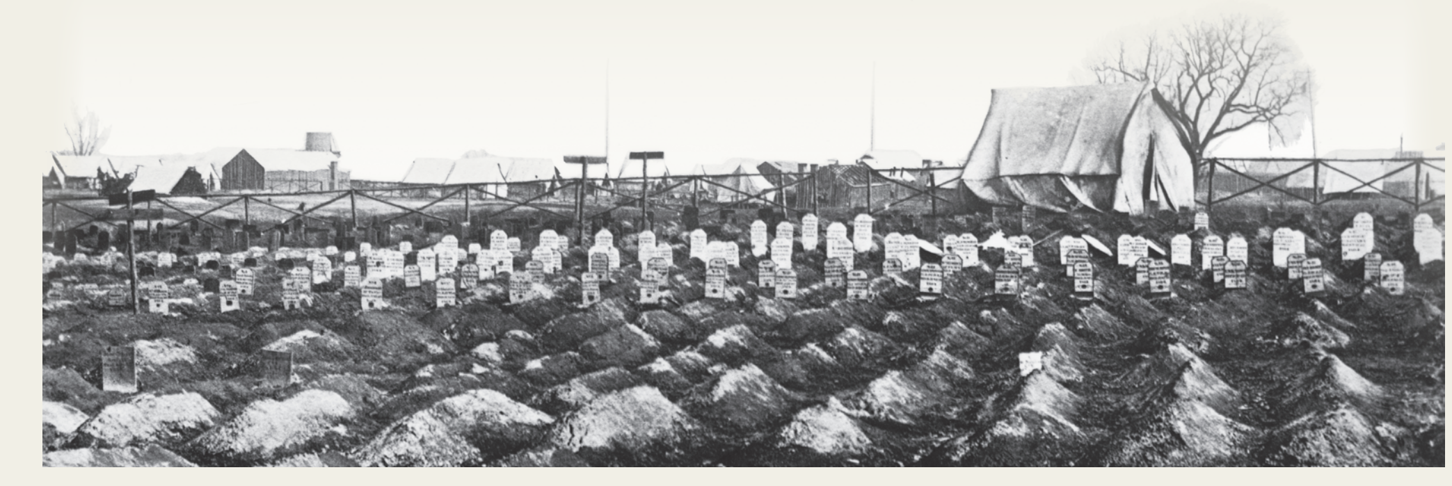
Soldiers' graves near General Hospital, City Point, Va., c. 1863.

On September 11, 1861, the War Department directed commanding officers to keep "accurate and permanent records of deceased soldiers." It also required the U.S. Army Quartermaster General, the office responsible for administering to the needs of troops in life and in death, to mark each grave with a headboard. A few months later, the department mandated interment of the dead in graves marked with numbered headboards, recorded in a register.