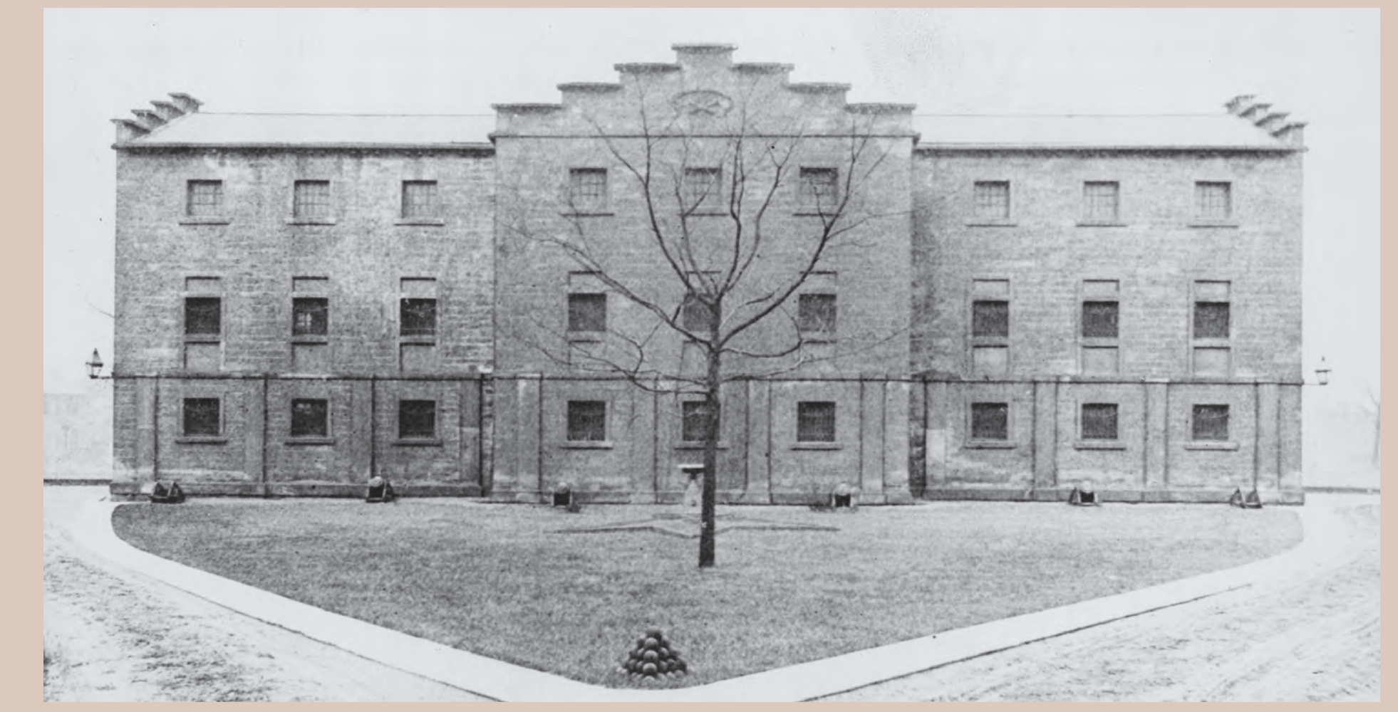
Allegheny Arsenal, in Pittsburgh's Lawrenceville neighborhood, manufactured cartridges and other ammunition for the Union. An explosion on September 12, 1862—the same day as the Battle of Antietam, Maryland—killed 78 workers, most young women. Many were buried together at Allegheny Cemetery.

Pittsburgh rallied for the war effort. In fall 1861, citizens formed a subsistence committee. Members served more than 400,000 meals to soldiers who passed through the city. Mercy Hospital, established in 1847 by the Sisters of Mercy, a Roman Catholic order of nuns, filled with sick and wounded soldiers. Overcrowding at Mercy led the federal government to establish a military hospital in 1862 at West Pennsylvania Hospital.