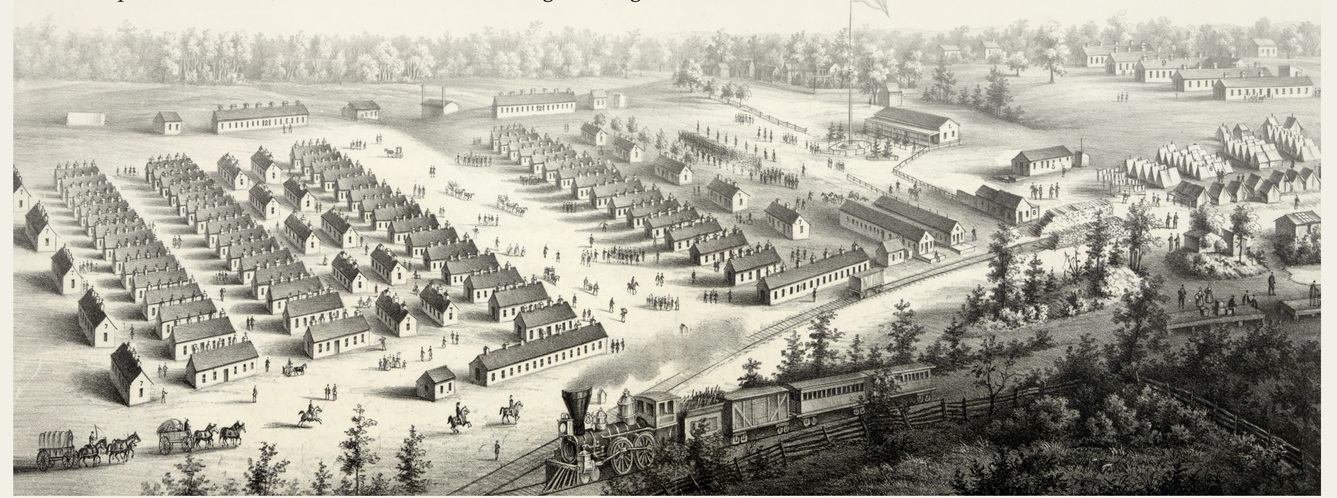
Camp Parole near Annapolis, 1865.