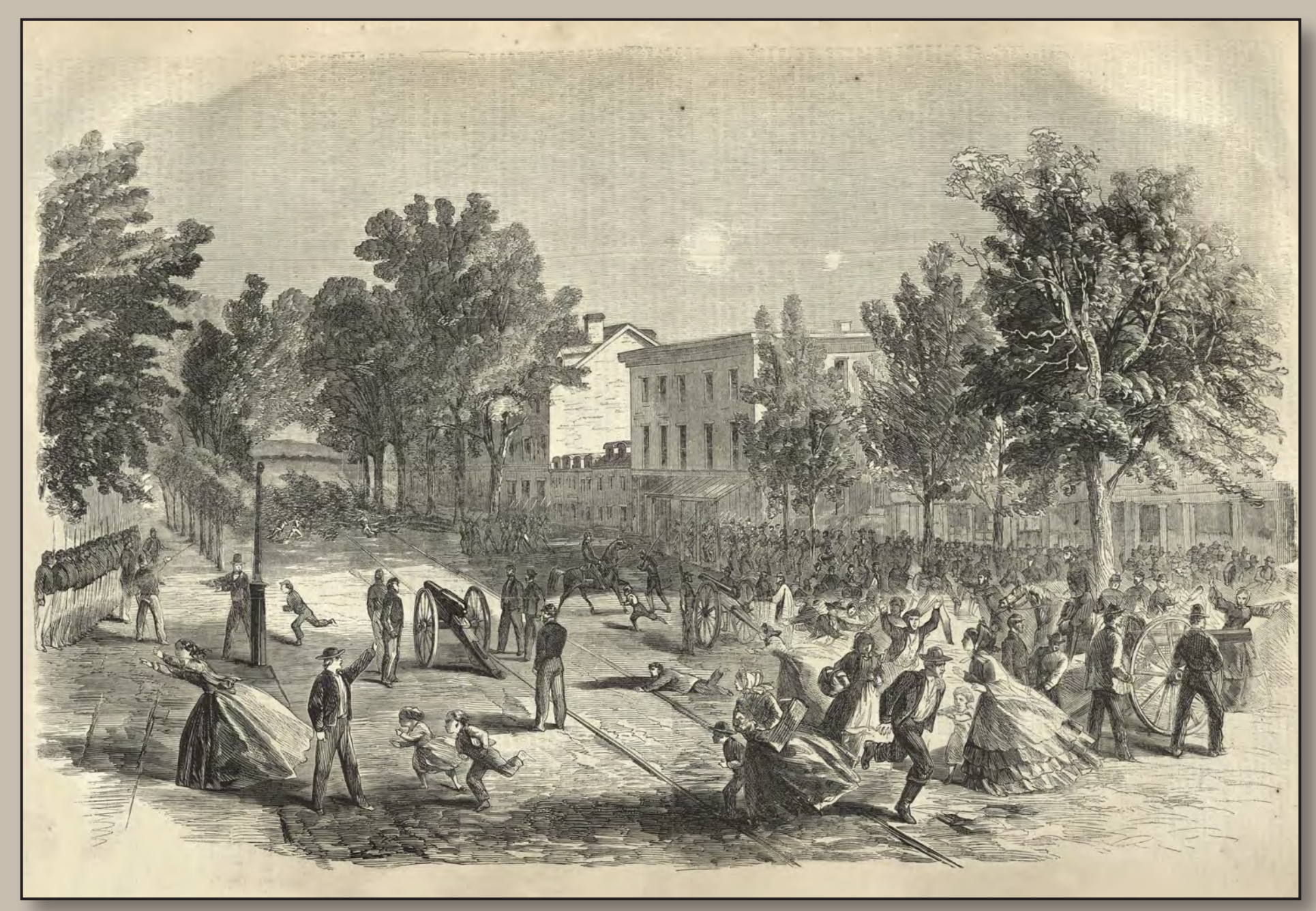
Confederate forces attack Carlisle. Harper's Weekly Magazine (July 25, 1863).

On July 1, Union forces set up artillery in Carlisle. When Confederate forces arrived and demanded their surrender, they declined. The Confederates burned Carlisle Barracks that night and departed. After the Battle of Gettysburg, 50 miles to the south, buildings at Dickenson College and many others in town served as temporary hospitals.