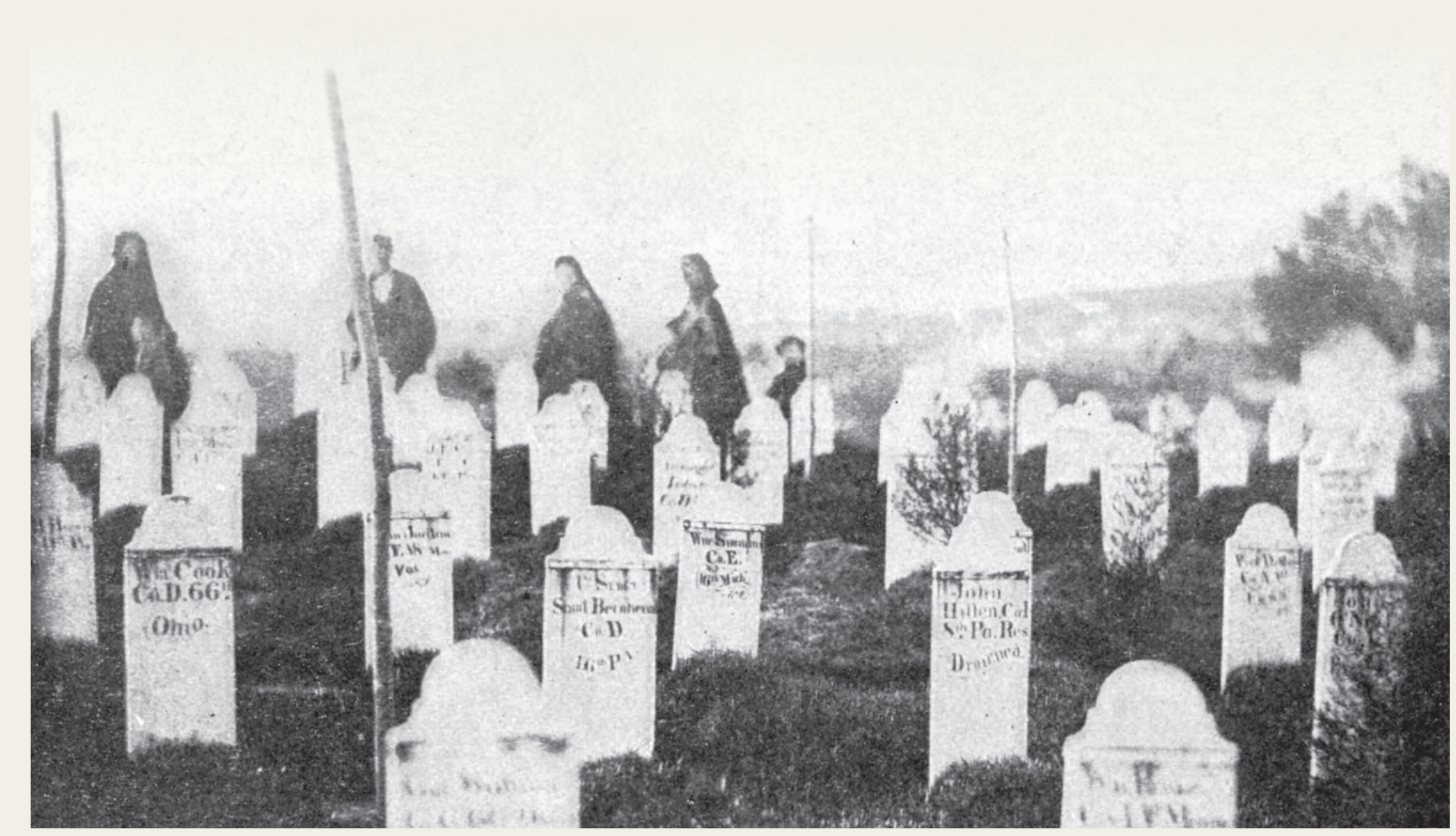
Mourners at Alexandria National Cemetery, Virginia, c. 1865. After 1873, standard marble headstones replaced the wood headboards seen here. Miller, Photographic History of the Civil War (1910).