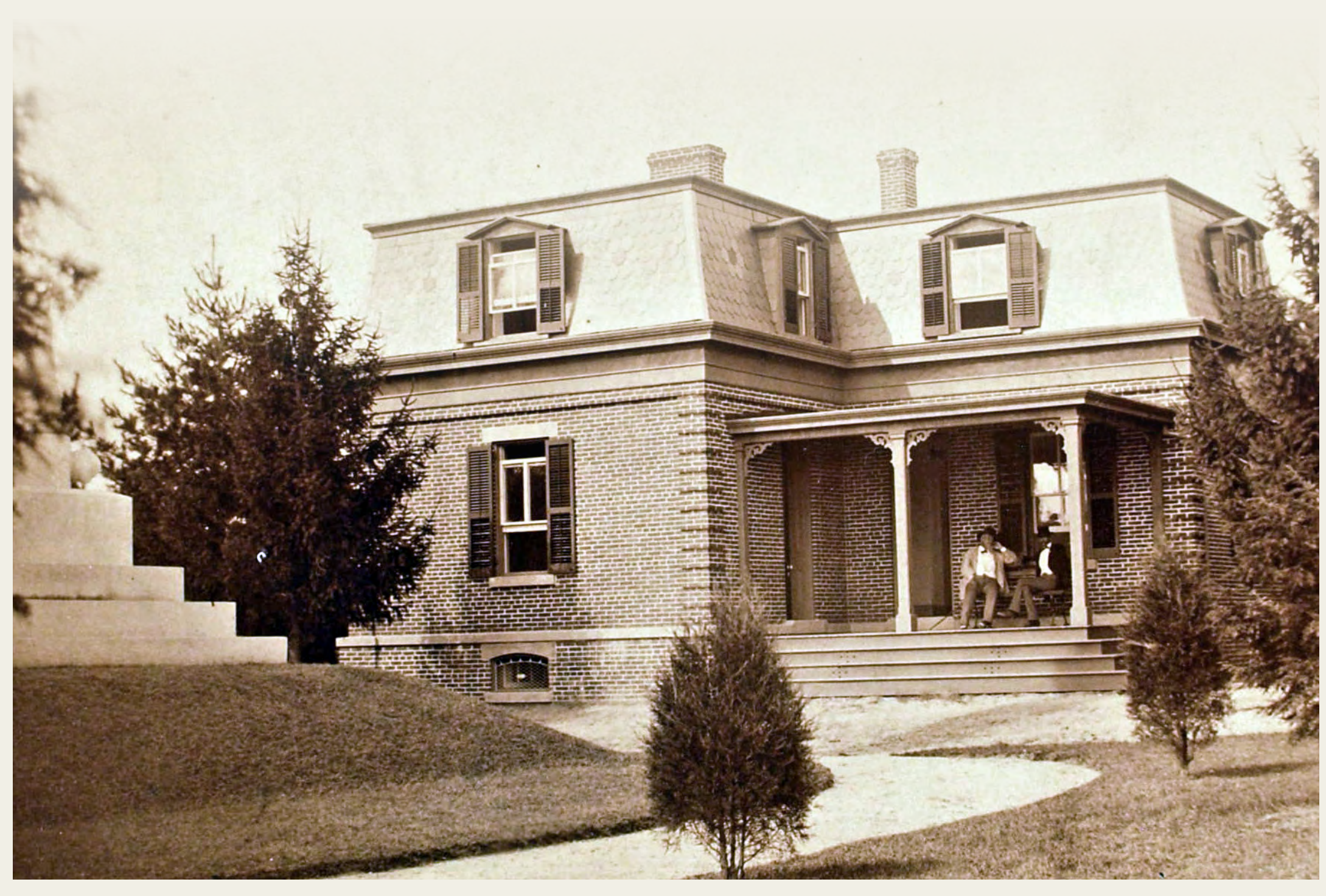
An 1898 view of the superintendent's lodge, erected 1879, and in front of it, the New Jersey Soldiers' Monument on a mound.