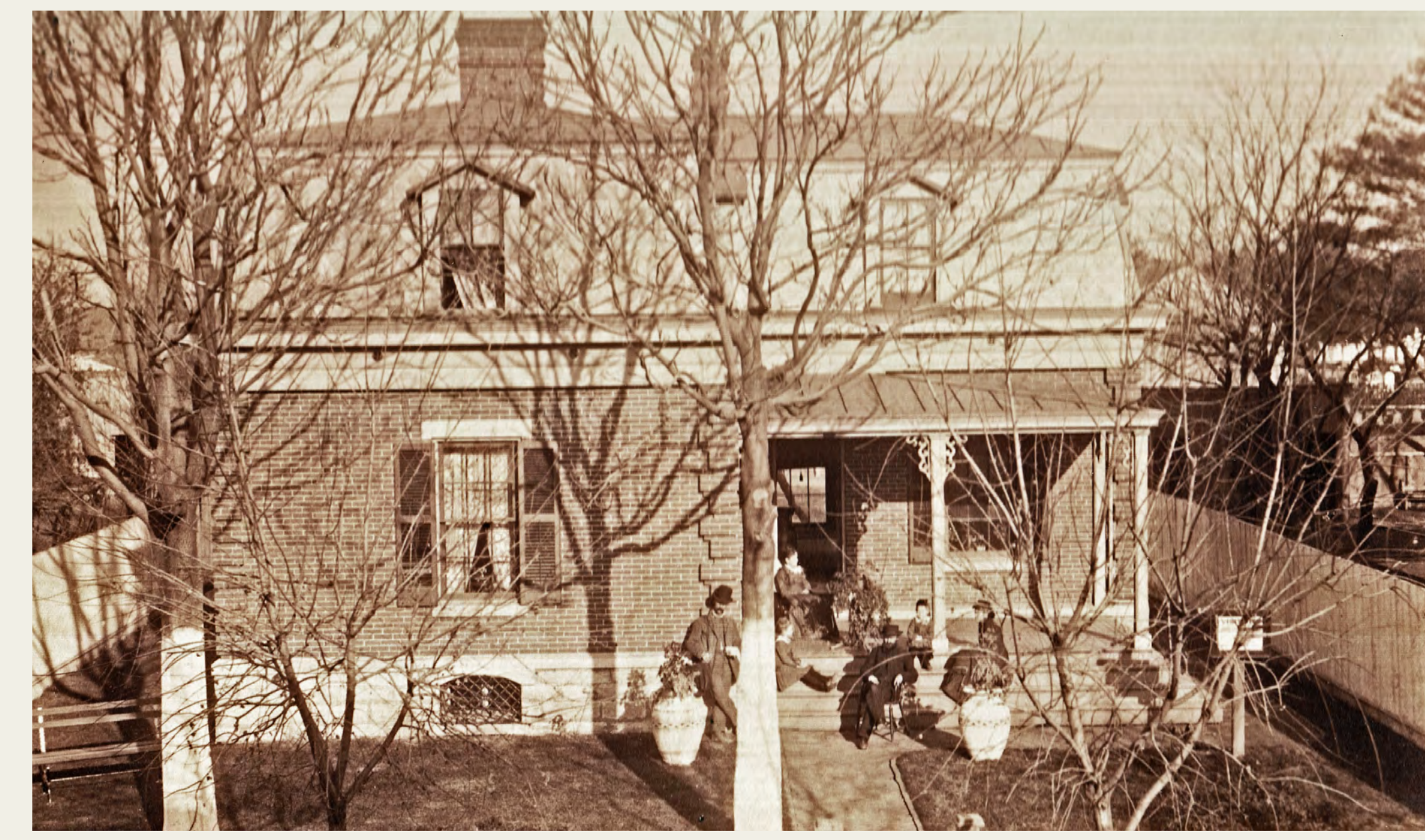
Superintendent's lodge, 1882. The Second Empire-style building, constructed in 1877 outside the cemetery wall, was sold in 1938.