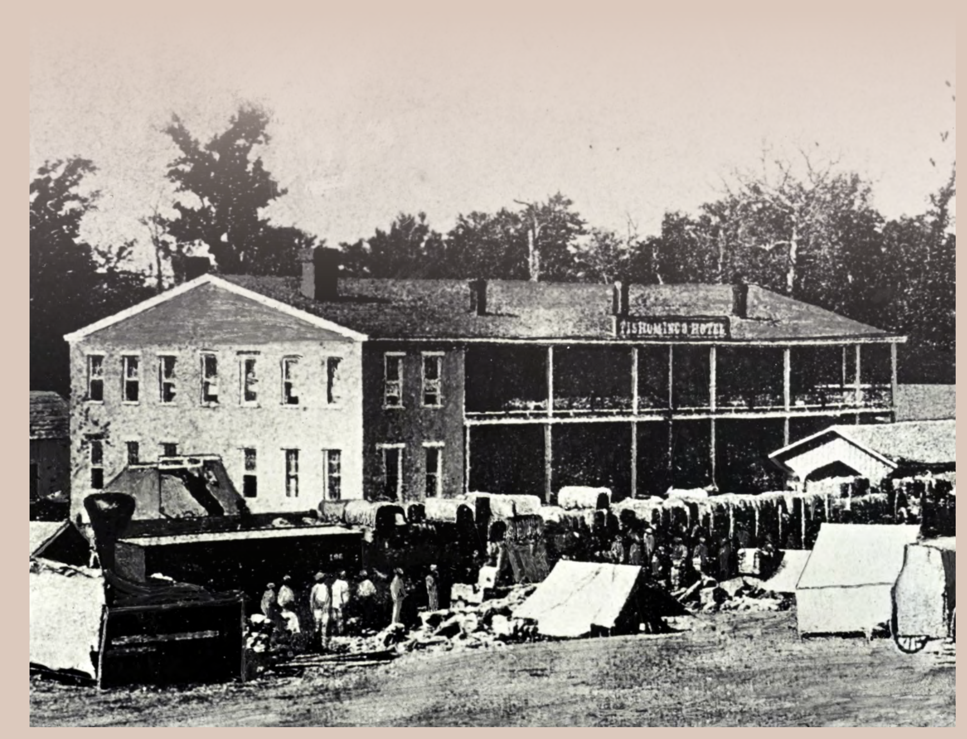
Union soldiers and supplies at the Corinth railroad depot, c. 1862.