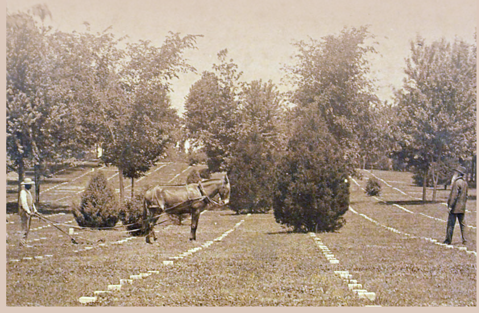
Groundskeeping among unknown grave markers at Corinth, 1892.

In the 1870s, the U.S. Army placed marble headstones on the graves, and erected a brick lodge for the superintendent. The lodge was replaced in 1934.