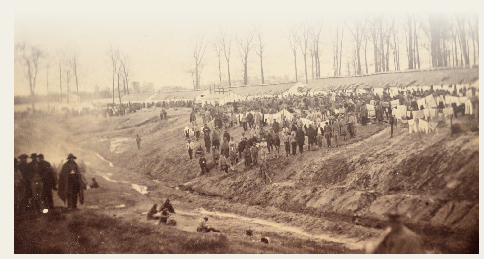
Confederate prisoners at Camp Morton, c. 1864.