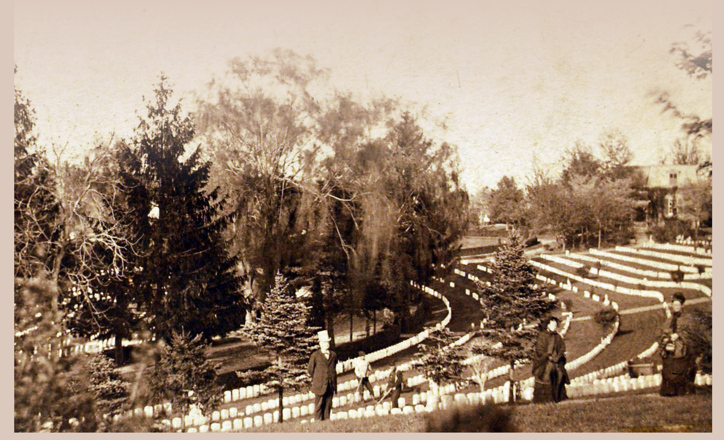
Union Grounds, c. 1880, with lodge in background at right.

Union soldiers originally buried at Fort Hamilton, Governor's Island, and Fort Wadsworth in New York City, and Mount Hope Cemetery in Otisville, New York, were reinterred in the new Jamaica Avenue tract. This move raised the number of Union dead in the national cemetery to 5,222; of these, 373 were unknown.