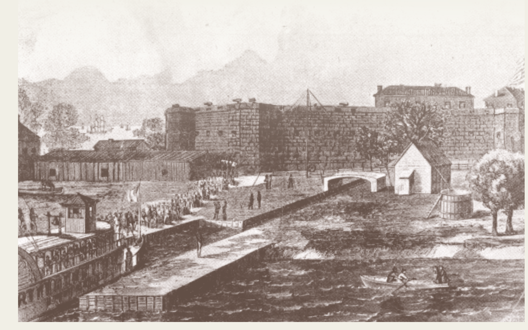
Confederate prisoners arriving at Fort Delaware, June 1863.

Overcrowding, poor diet, lack of clean drinking water, and swampy ground that bred mosquitos contributed to a high rate of disease. Over a single three-month period, diarrhea, pneumonia, scurvy, typhoid, dysentery and other illnesses claimed more than 12 percent of the prison population.