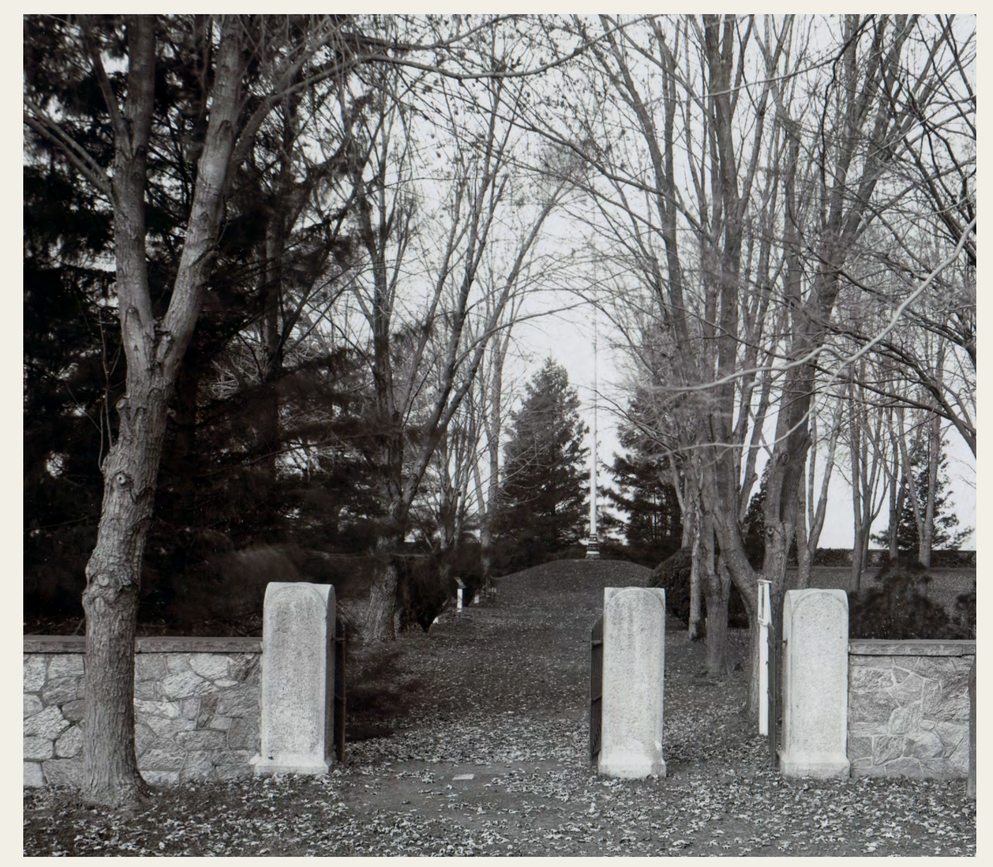
The wall and gate in 1903.

Union soldiers, many of whom were prison guards, died at Fort Delaware. They were buried in a post cemetery established outside the fort walls on Pea Patch Island.