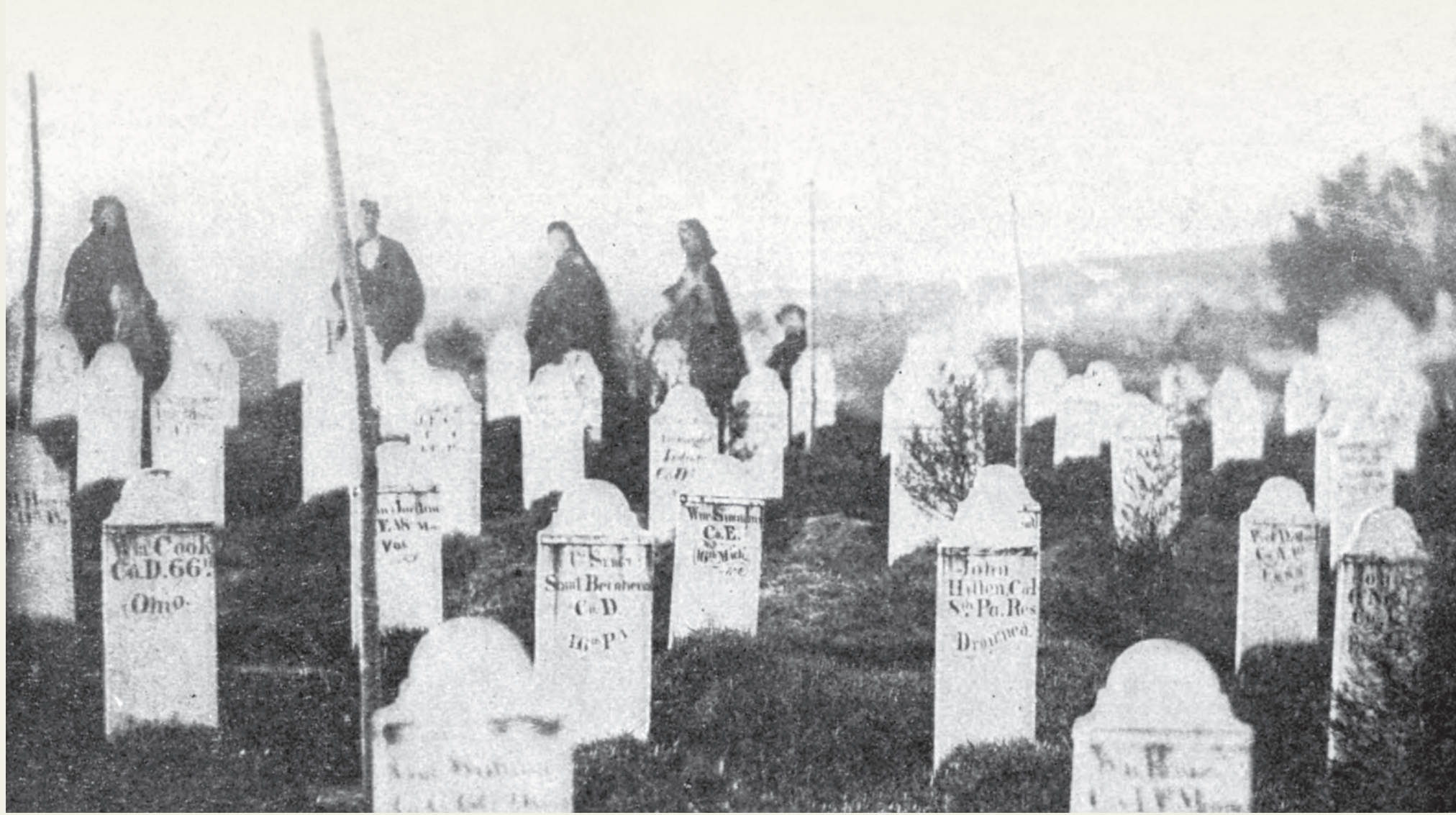
Mourners at Alexandria National Cemetery, Virginia, c. 1865. After 1873, standard marble headstones replaced the wood headboards seen here. Miller, Photographic History of the Civil War (1910).