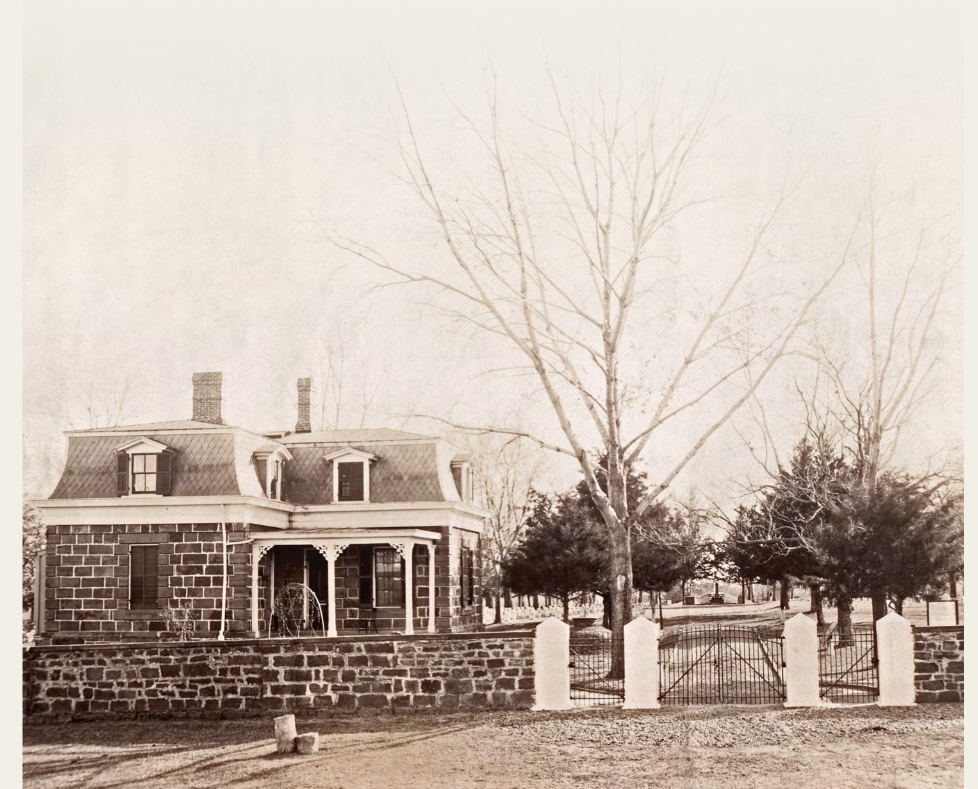
Second Empire-style lodge and wall, 1903.

In 1872, Secretary of War William W. Belknap directed the quartermaster general to relocate the dead from Fort Washita, Fort Towson, and Fort Arbuckle in southern Oklahoma to this cemetery. The remains of Union soldiers from other battlefields and sites in Oklahoma, Kansas, and Missouri were eventually reinterred here, too. By 1874, the cemetery contained 2,296 graves, of which only 194 were known.