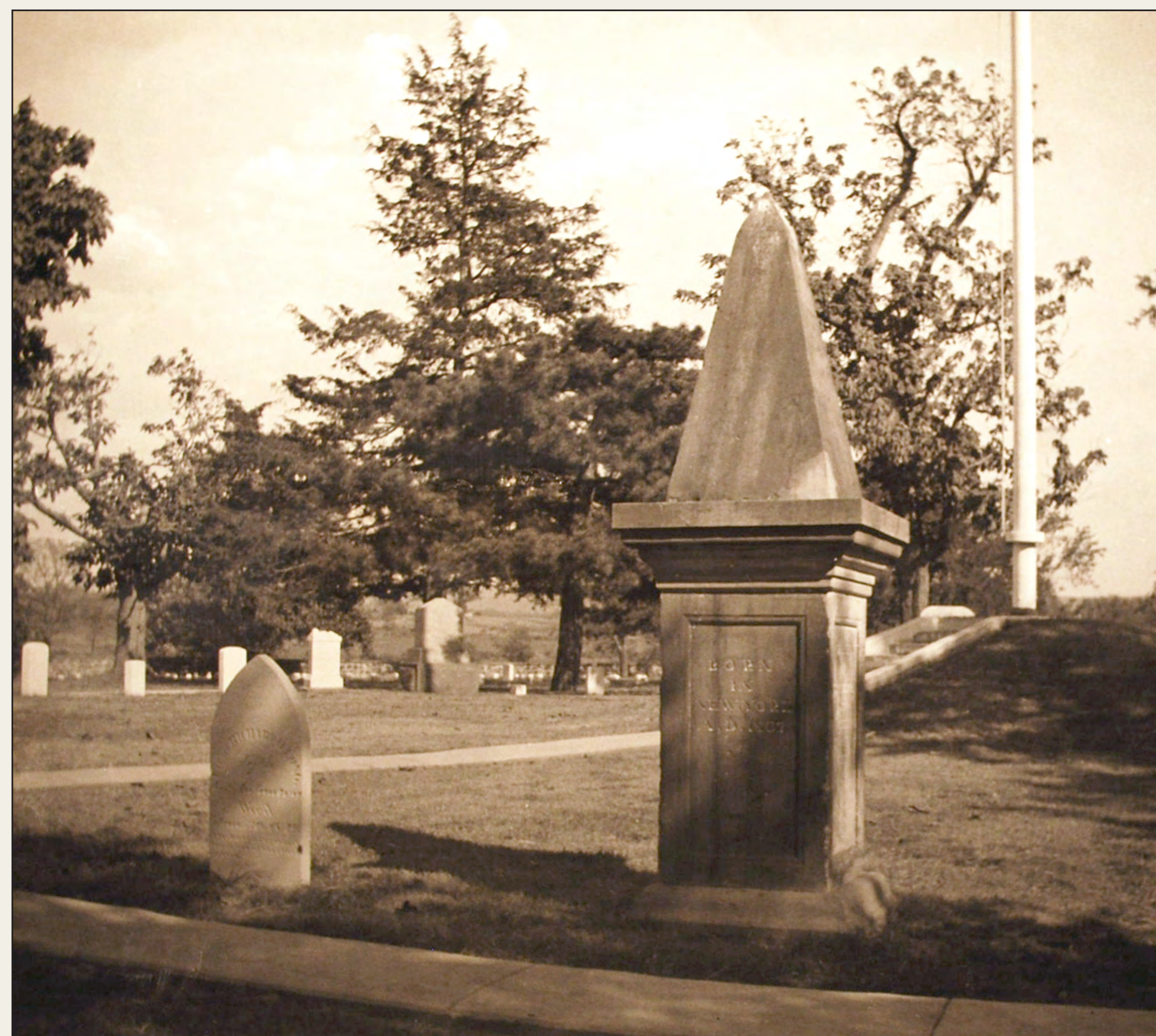
Undated view of cemetery showing private headstones in the officers' circle. National Archives and Records Administration.

Reoccupation of the garrison during the Civil War meant more interments. In 1868, a new Fort Gibson National Cemetery was established on land formerly part of the larger military reservation. It was laid out in four sections with a central officers' circle and flagpole. In 1871, there were 2,123 graves in the cemetery—156 known Union soldiers and 1,967 dead associated with the post.