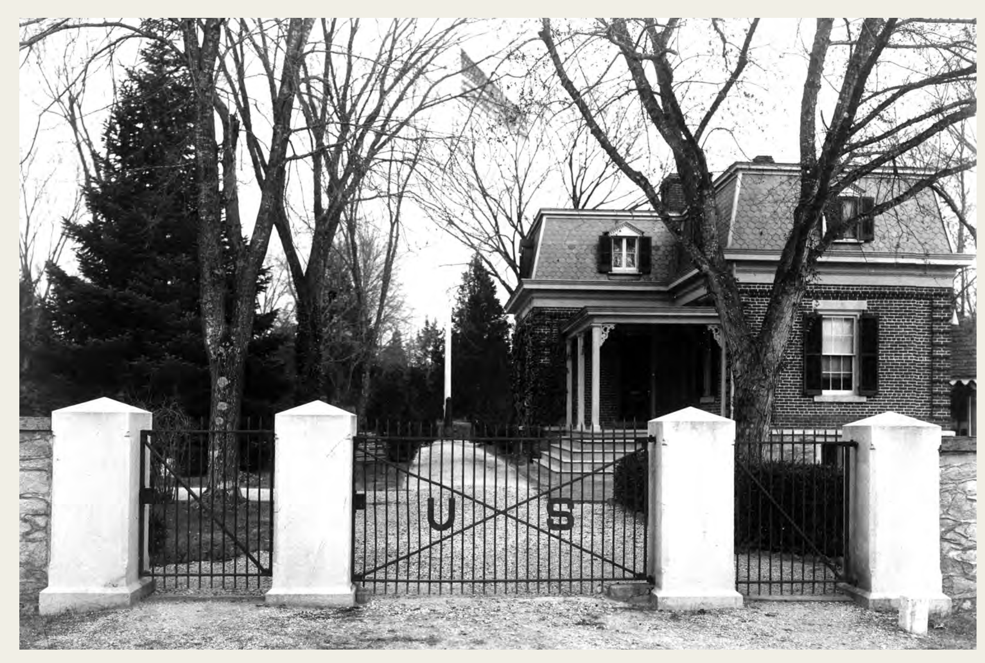
Cemetery entrance, 1904.