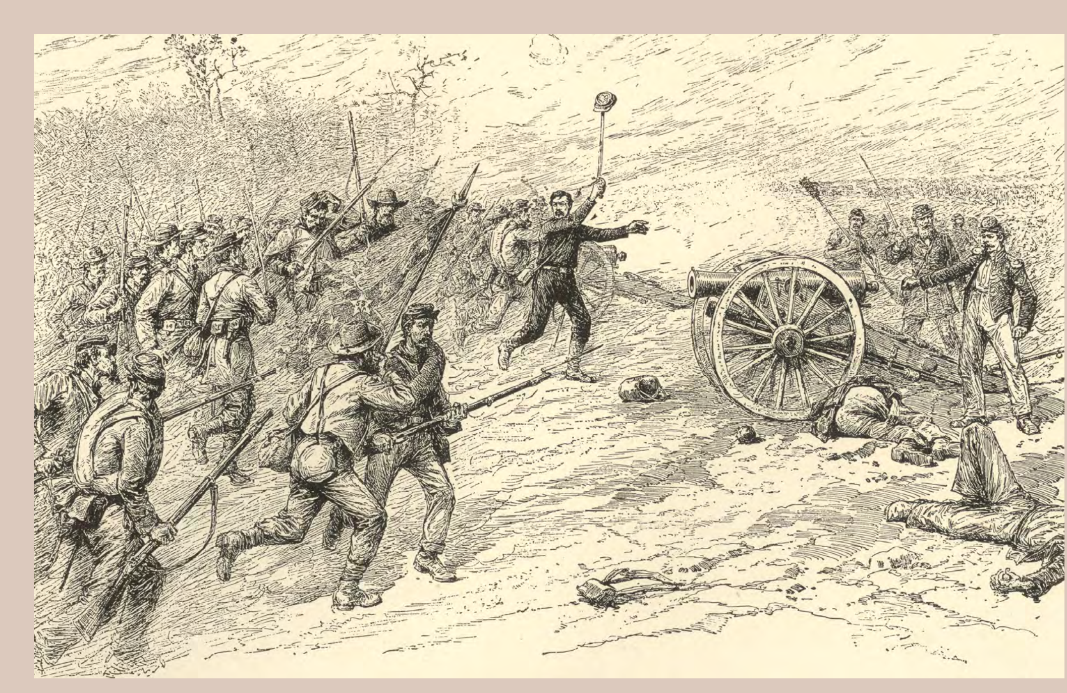
Battle of Glendale, also known as Frayser's Farm. The Century War Book, 1894.