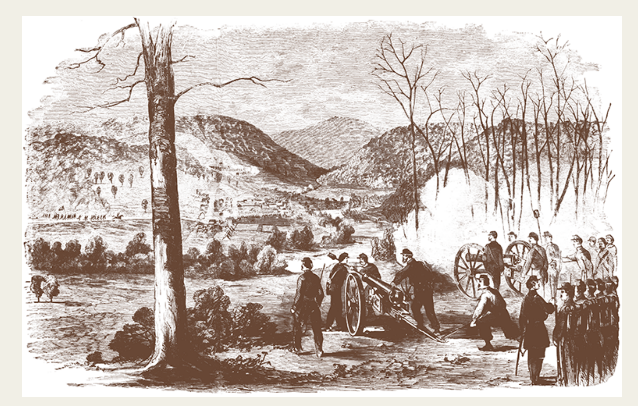
Battle of Philippi, June 3, 1861. The Soldier in Our Civil War (1895).

The U.S. Constitution allows for the formation of a new state from an existing one if the original state consents. Since the federal government accepted the Restored Government as Virginia's legal authority, the state granted itself permission. On June 20, 1863, West Virginia was officially created with the provision that slavery would gradually be abolished in the new state.