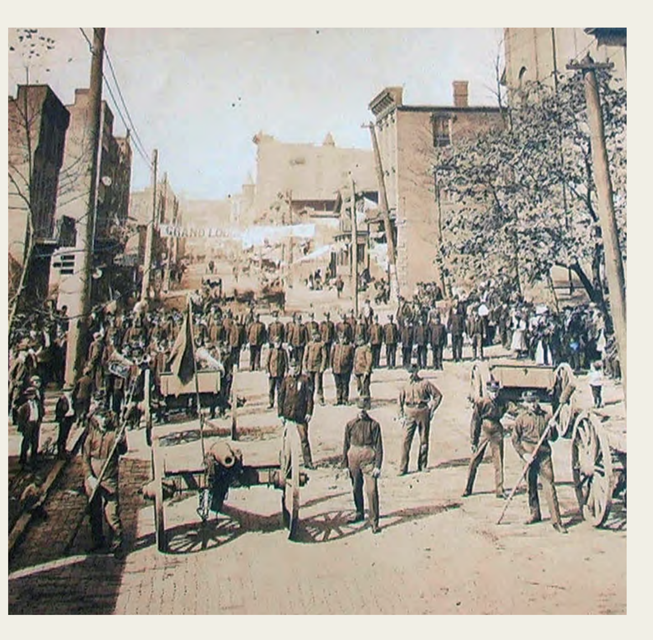
Memorial Day parade in Grafton, c. 1900.

In 1882, local Union veterans formed a chapter of the Grand Army of the Republic (GAR). "Flower strewing day" officially became Decoration Day (later Memorial Day) when the GAR adopted the formal name. Grafton became known as "Memorial City" as the annual event gained recognition.