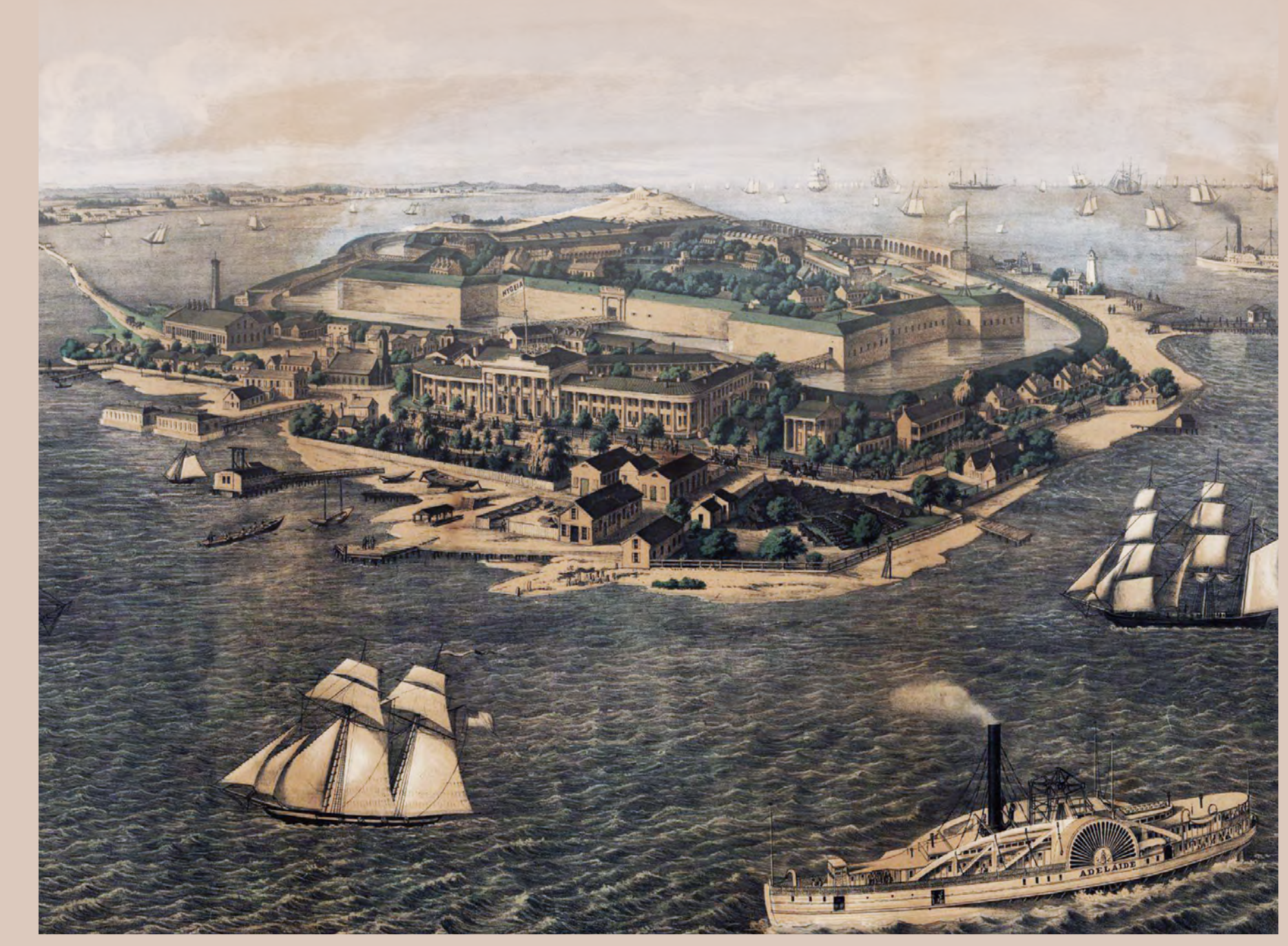
Fort Monroe as it appeared c. 1861.

Troops in these and other campaigns often returned to Hampton as casualties. Chesapeake Military Hospital and Hampton Military Hospital, with a total of 1,800 beds, treated sick and wounded officers and enlisted men.