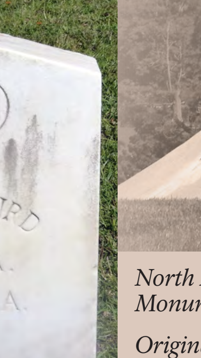
North Alton Confederate Cemetery Monument, 1909, Alton, Ill.

Original Commission headstone (left) and headstone with Southern Cross of Honor (right).