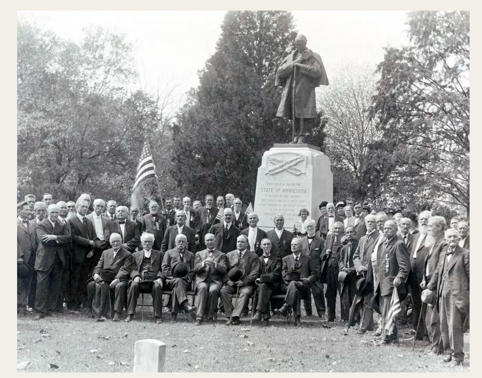
Veterans and dignitaries at the Minnesota Monument dedication, September 22, 1916