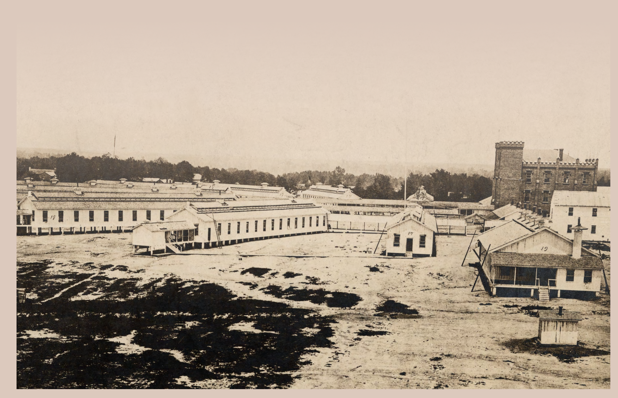
St. John's Hospital in Little Rock, c. 1870.