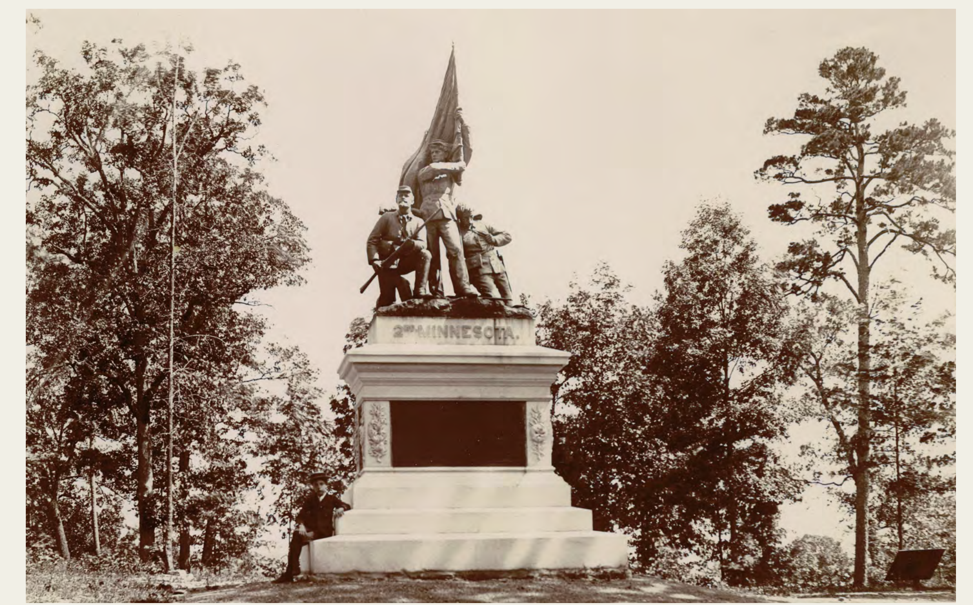
The Soldiers Monument at Chickamauga, 1895. Longstreet-Thomas Library Trust, Fort Oglethorpe, Georgia.

It is a copy of a larger work erected in 1894 on the Chickamauga battlefield in Georgia. The Marion monument, unveiled in 1914, honors all Union soldiers. Its location at the original cemetery entrance is a reminder that the National Home was built to care for Civil War veterans.