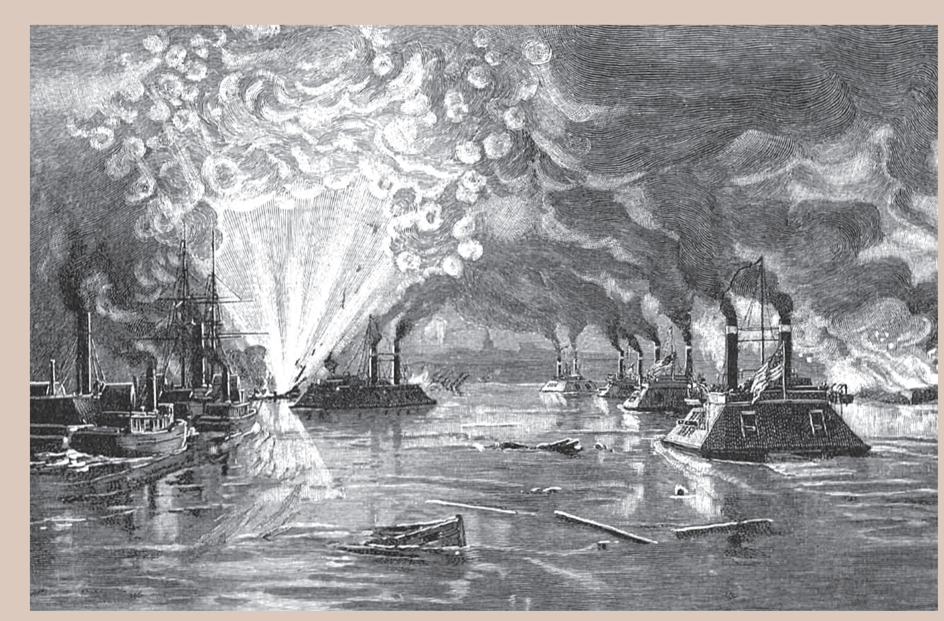
Battle of Memphis, June 6, 1862. Battles and Leaders of the Civil War (1887).