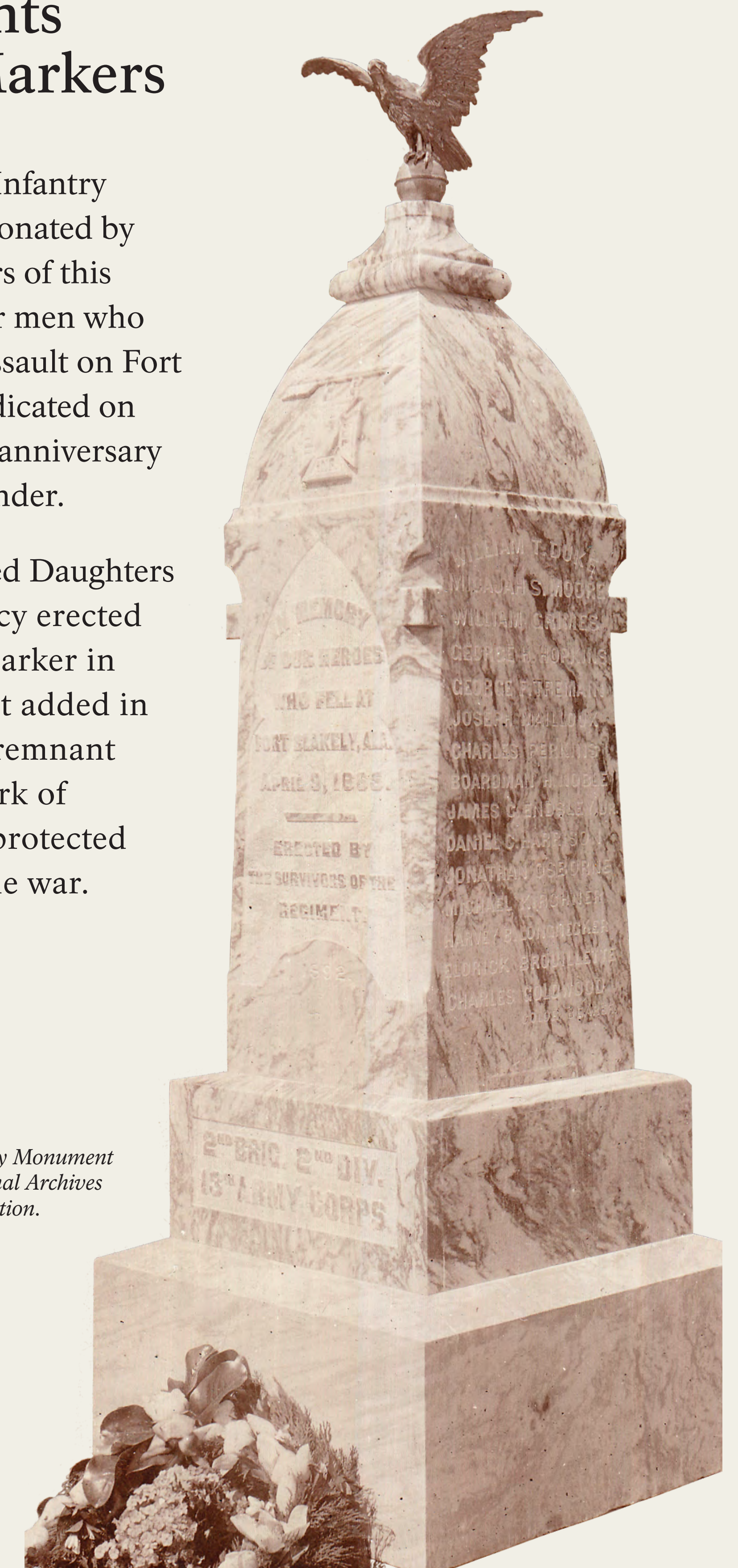
The 76th Illinois Infantry Monument on April 9, 1892.

In 1940, the United Daughters of the Confederacy erected an interpretive marker in the cemetery tract added in 1936. It marks a remnant of the vast network of earthworks that protected the city during the war.