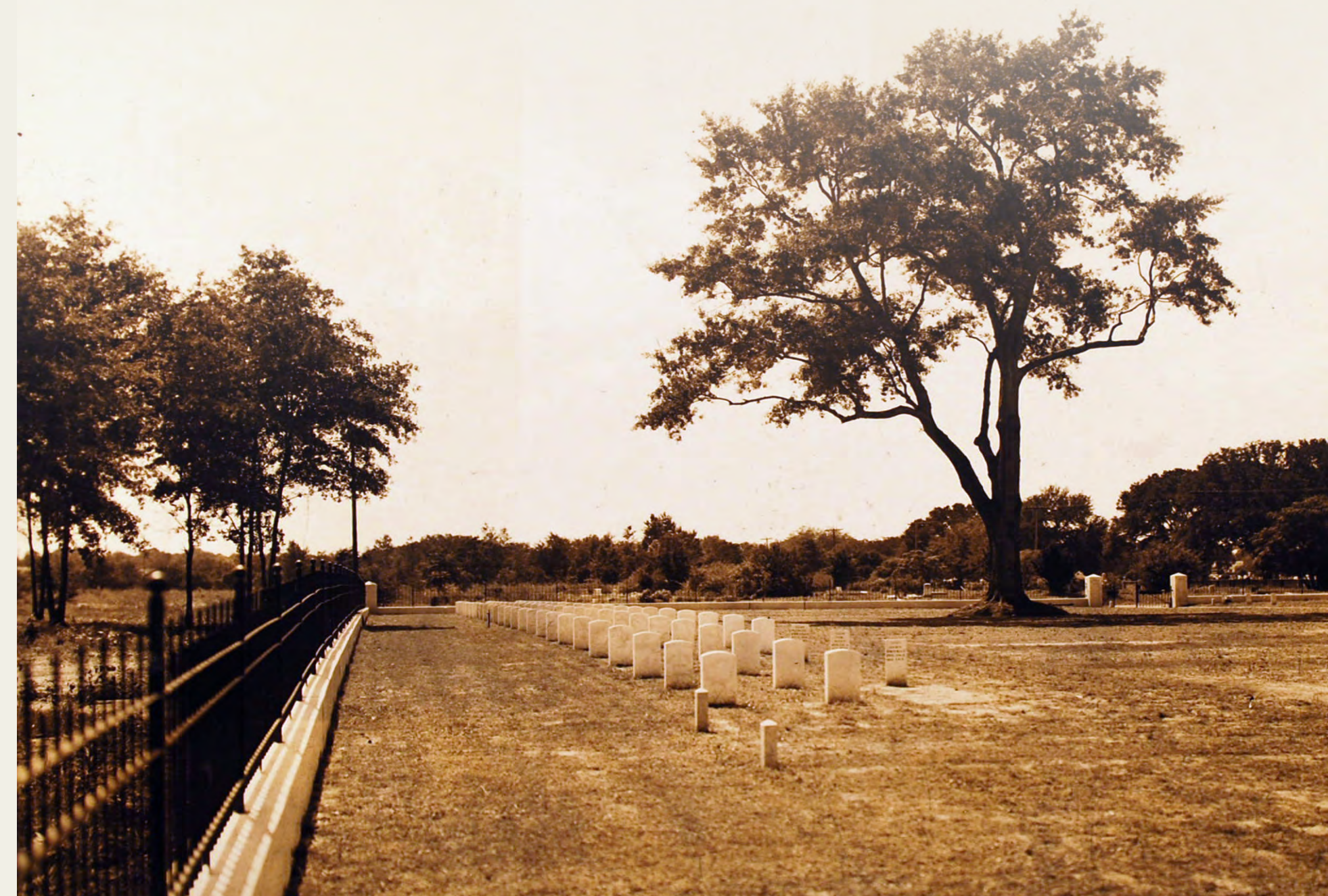
The new section of the cemetery after it was purchased in 1936. National Archives and Records Administration.

In the 1870s, the U.S. Army built a brick wall around the cemetery. A brick Second Empire-style lodge for the superintendent and his family was erected in 1881. A decade later, an octagonal brick-and-iron rostrum was constructed for ceremonial events. In 1936, the government expanded the cemetery by purchasing 3 acres on the opposite side of Virginia Street. The remains of four Confederate soldiers are buried in that section.