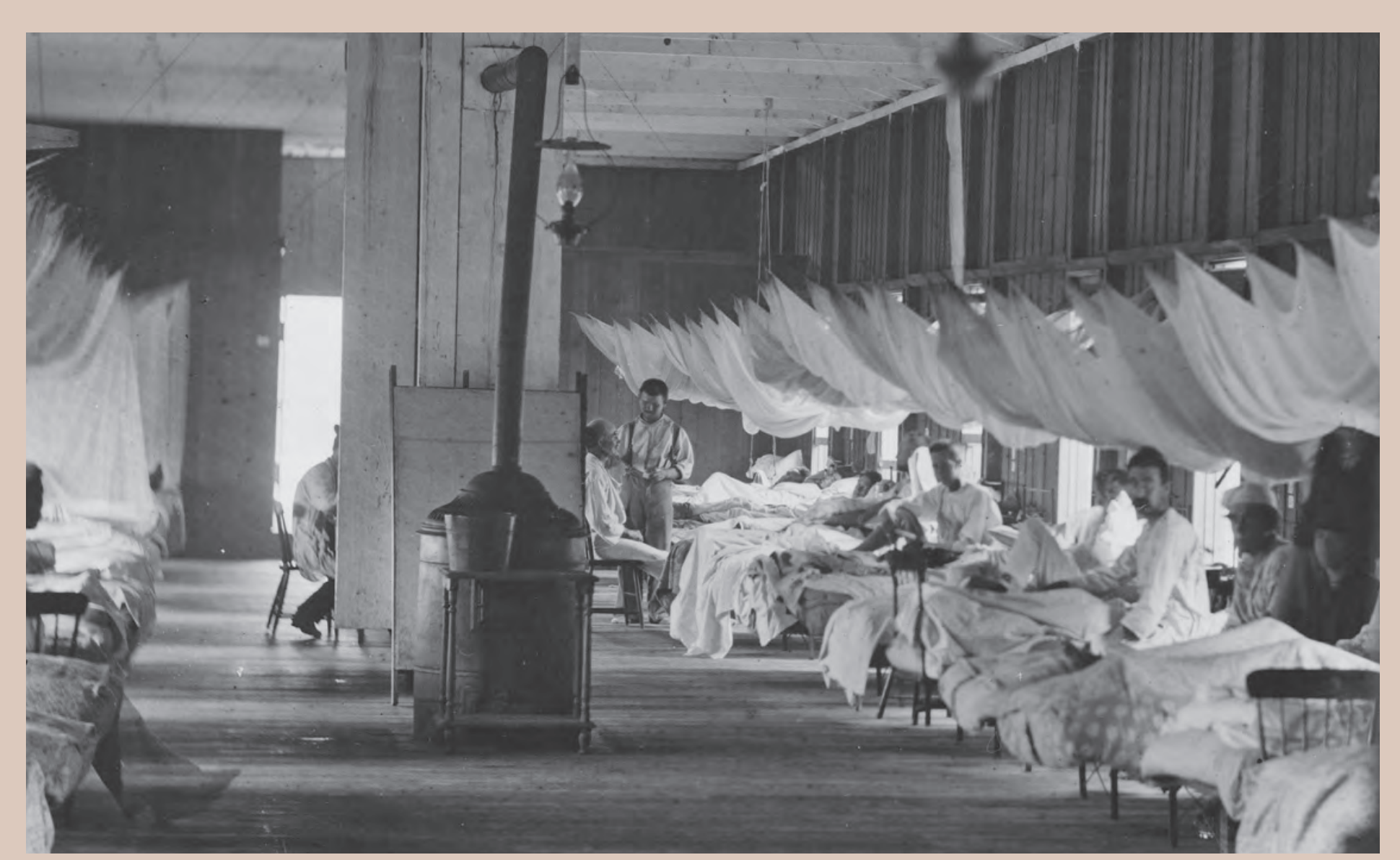
This ward at a Washington, D.C., hospital was typical of those where Union soldiers were treated during the Civil War.

Over the course of the Civil War, more than 157,000 soldiers, sailors, and Confederate prisoners were treated in Philadelphia hospitals. Many died from disease or their wounds and were buried in nearby cemeteries.