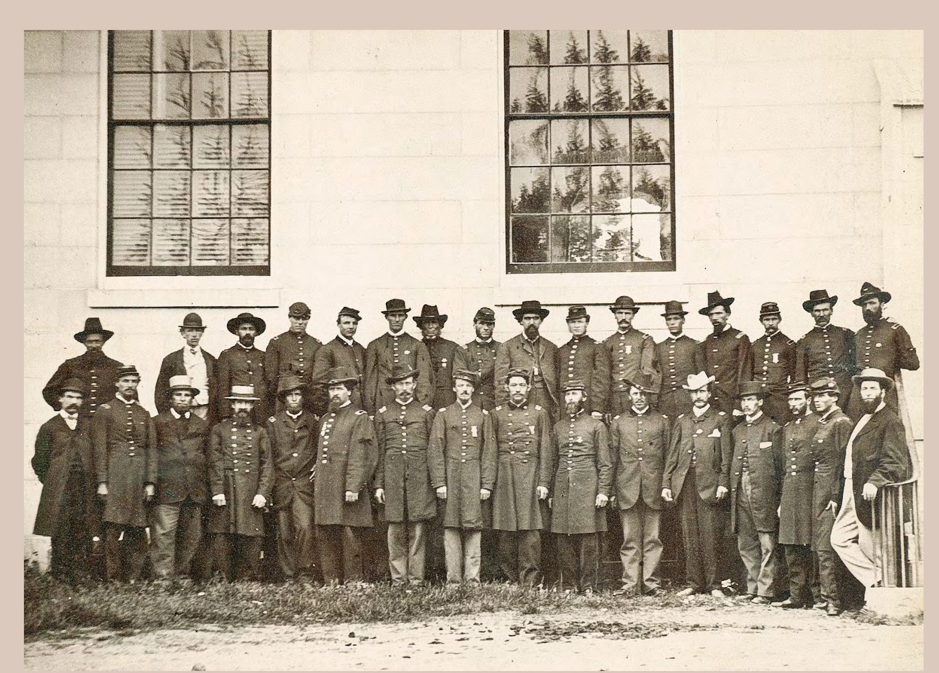
Field, staff, and line officers of the 19th Maine Volunteer Infantry, c. 1865.

In 1862, a rendezvous was designated at Augusta for new recruits. Known as Camp Keyes, barracks and other structures were constructed on farmland overlooking the capital city. Camp Keyes served briefly as a hospital until this function moved to Camp Cony, a former cavalry barracks. The latter was expanded and renamed Cony General Hospital. It was Maine's only U.S. General Hospital where sick and wounded Union soldiers were treated throughout the Civil War.