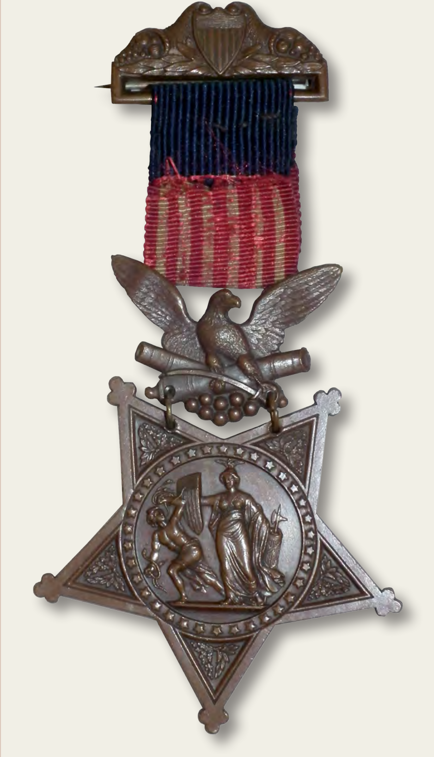
Civil War Army Medal of Honor. Gettysburg National Military Park.