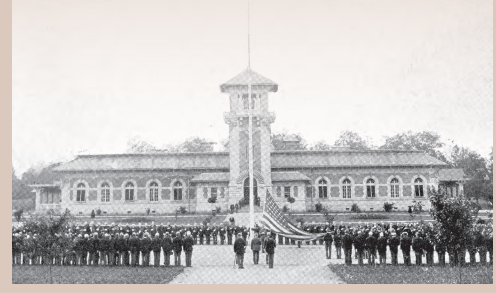
Mountain Branch, National Home for Disabled Volunteer Soldiers, c. 1910.