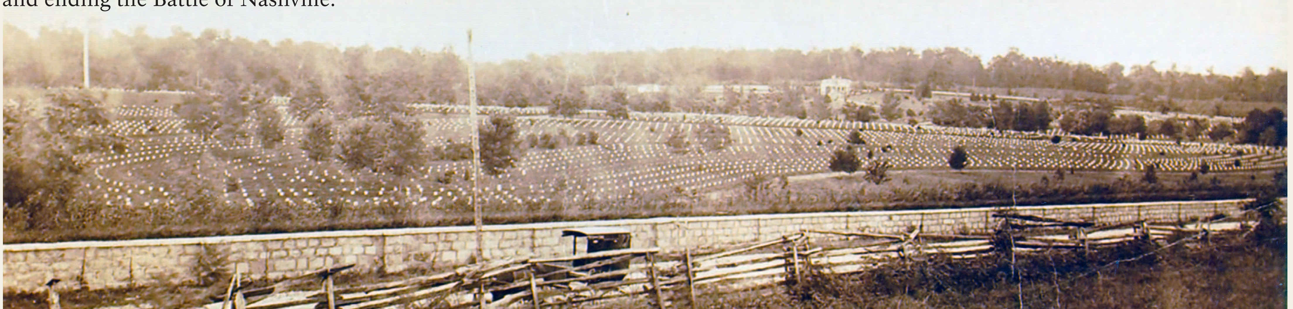
The cemetery in 1873, with road and limestone wall in foreground.

In 1870 the army built a 32-foot-high monumental Neoclassical archway facing Gallatin Pike as the cemetery entrance. It is the oldest of five such arches erected in southern national cemeteries. By 1874, an estimated 16,538 individuals were buried here, with approximately one-quarter unknown.