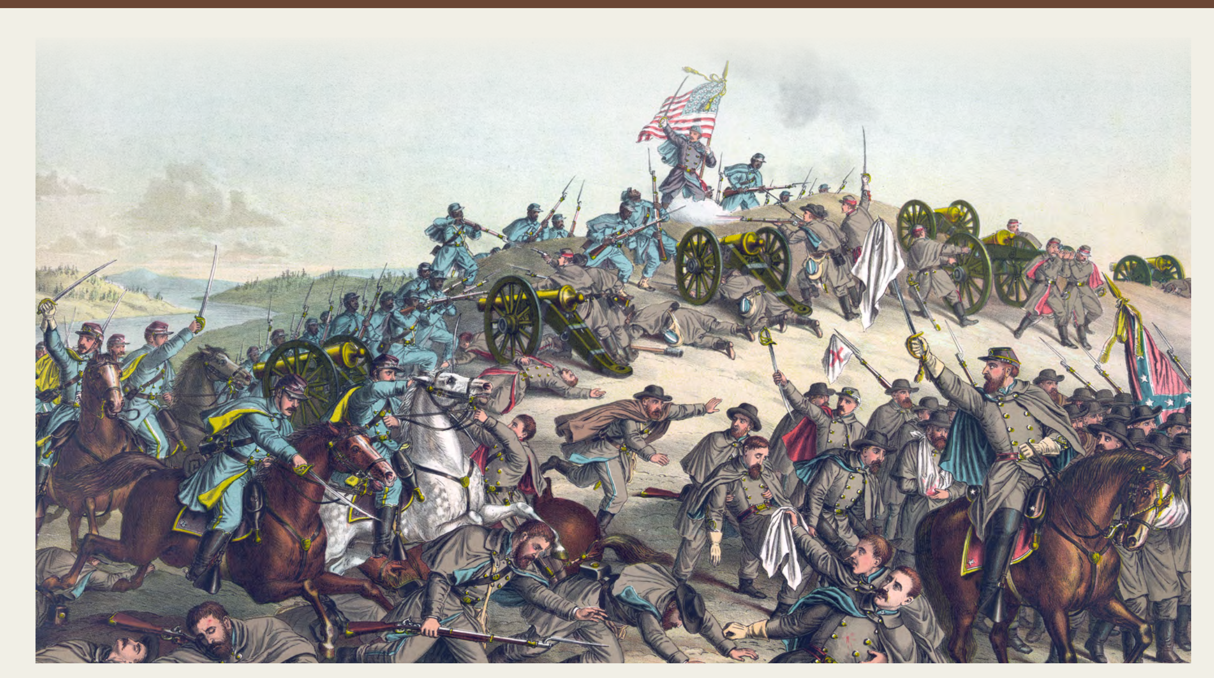
An 1891 depiction of the U.S. Colored Troops charging Overton Hill.