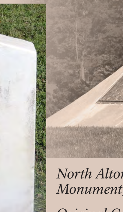
North Alton Confederate Cemetery Monument, 1909, Alton, Ill.

Original Commission headstone (left) and headstone with Southern Cross of Honor (right).