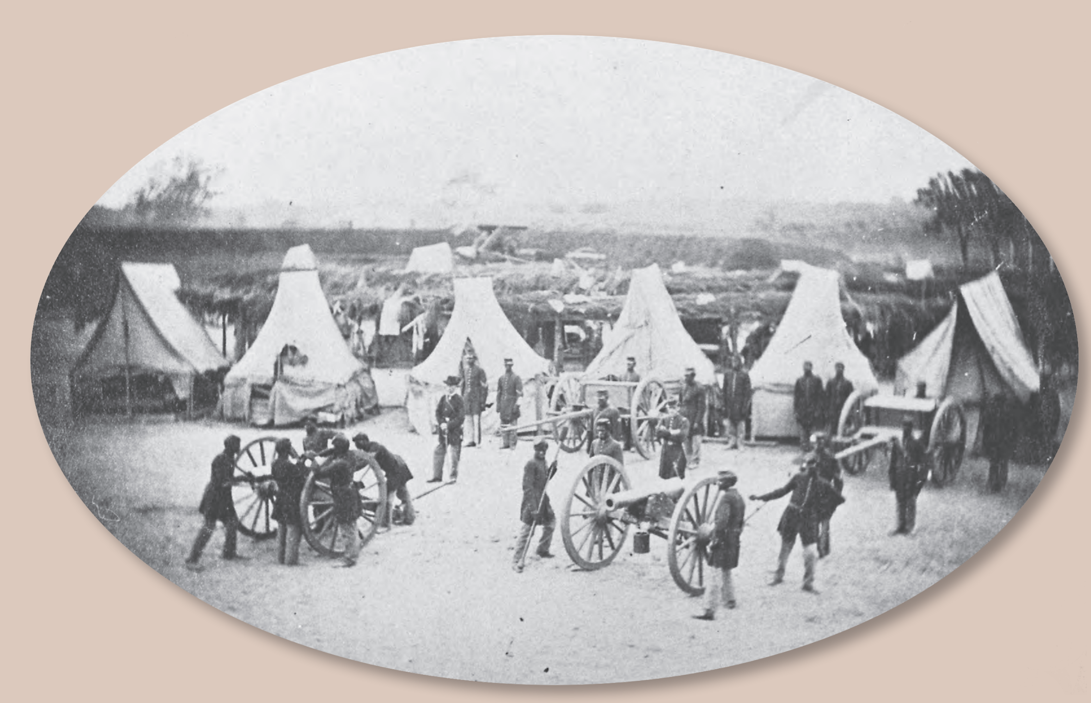
The 1st and 3rd Louisiana Native Guards drill near Port Hudson in 1863.