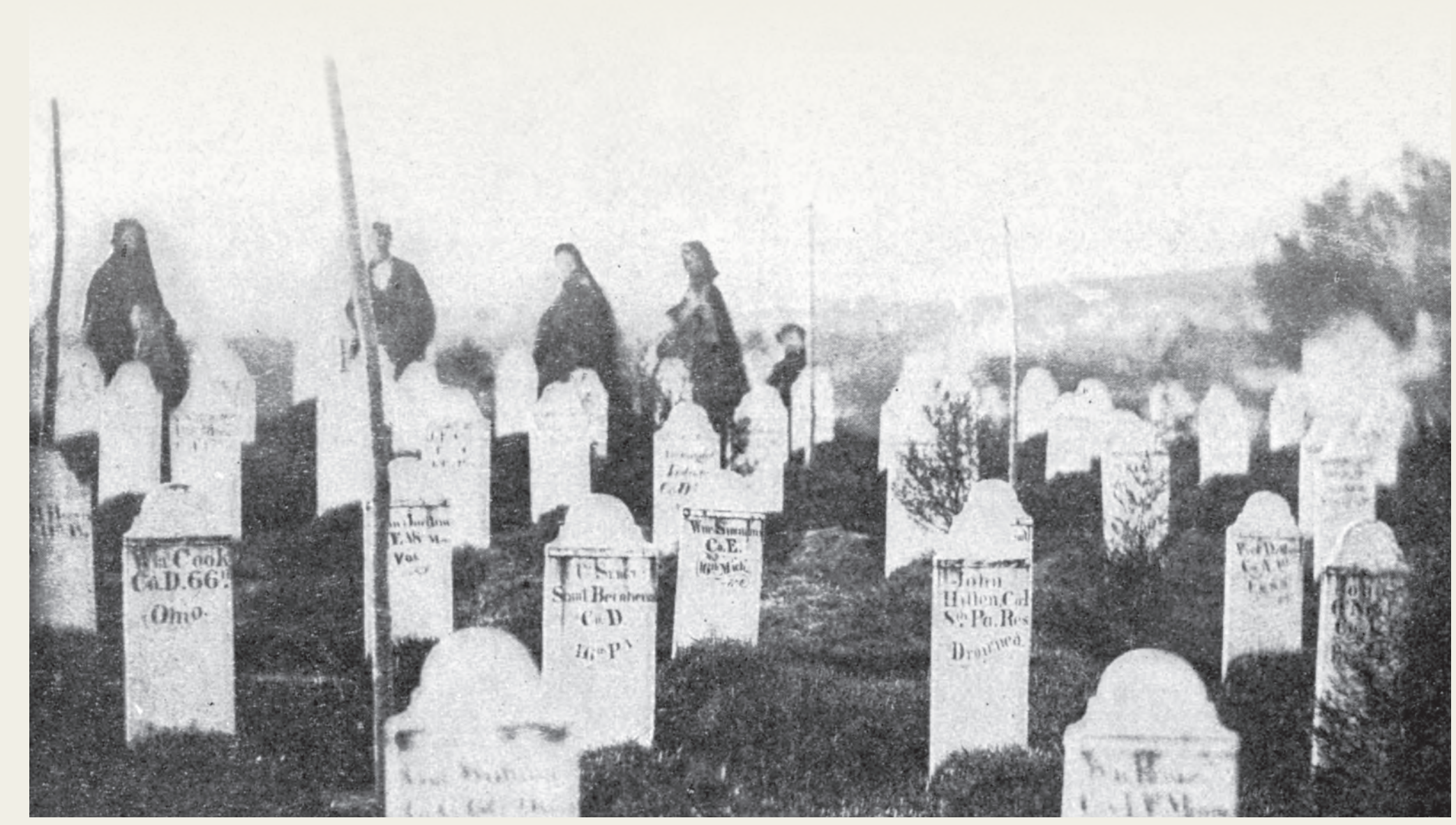
Mourners at Alexandria National Cemetery, Virginia, c. 1865. After 1873, standard marble headstones replaced the wood headboards seen here. Miller, Photographic History of the Civil War (1910).