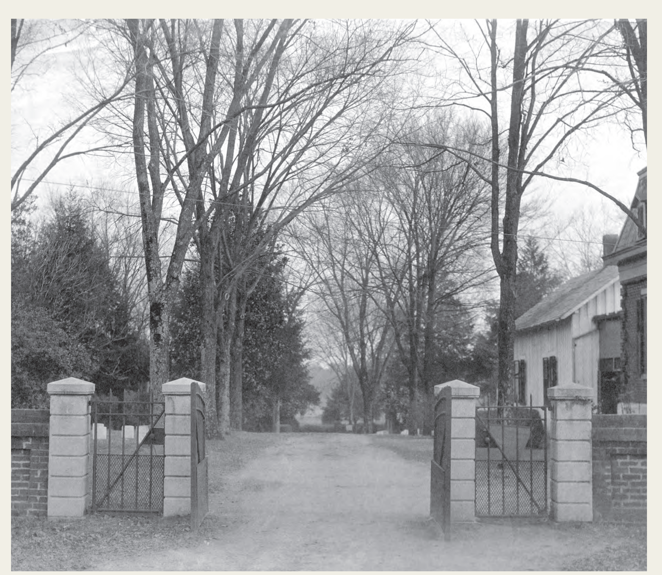
View into cemetery, 1904. Visible on right is the original wood-frame lodge, reused as a kitchen and tool-house after the new brick lodge was built in 1874.

The remains of 1,173 soldiers were reinterred here from other locations in Raleigh; the Averasboro, Bentonville and Goldsboro battlefields; and elsewhere in the state. Volunteer regiments from thirteen states are represented, and were buried together. Other sections were set aside for U.S. Army Regulars and U.S. Colored Troops. Four sections contain 547 unknown soldiers.