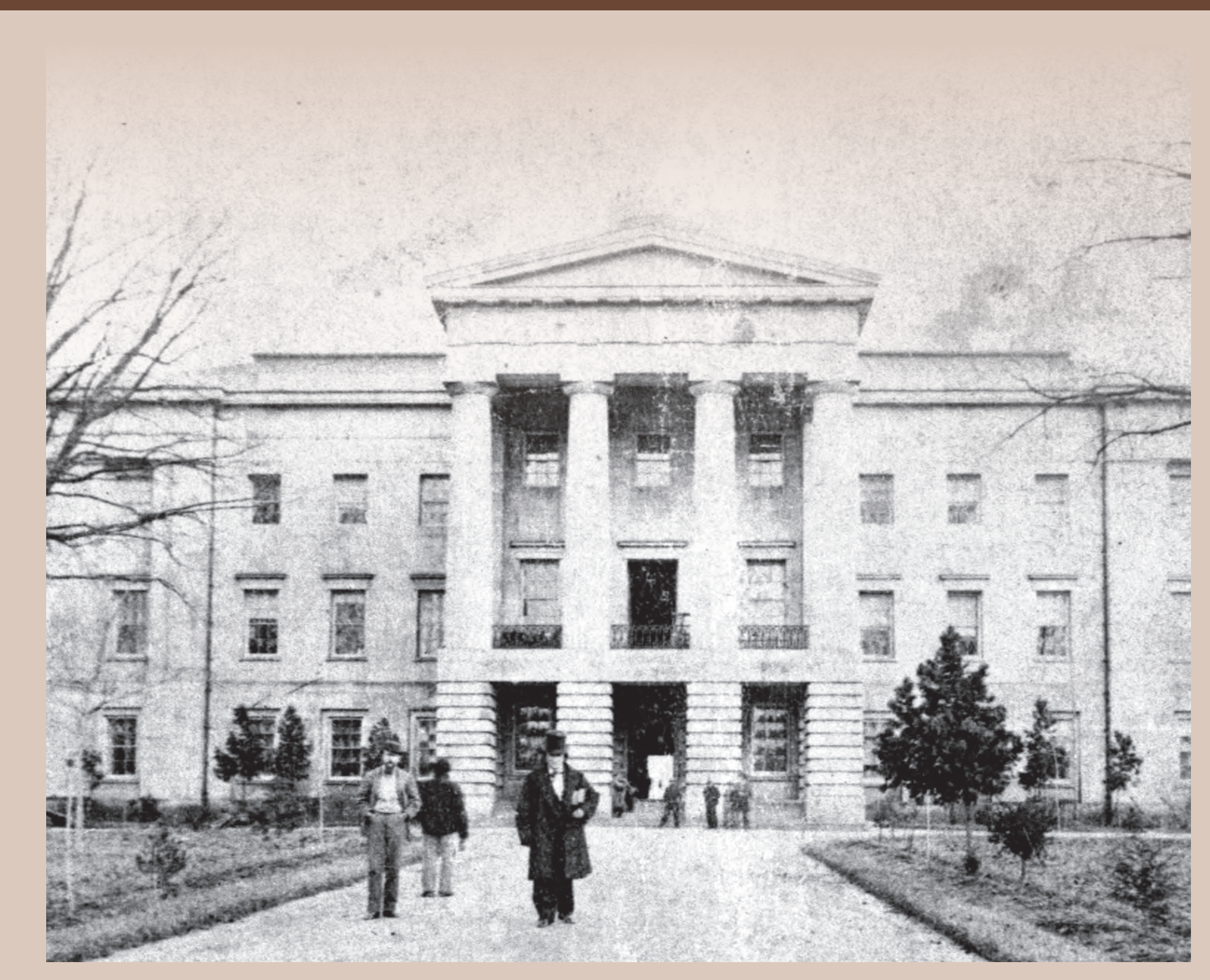
North Carolina State Capitol, 1861.