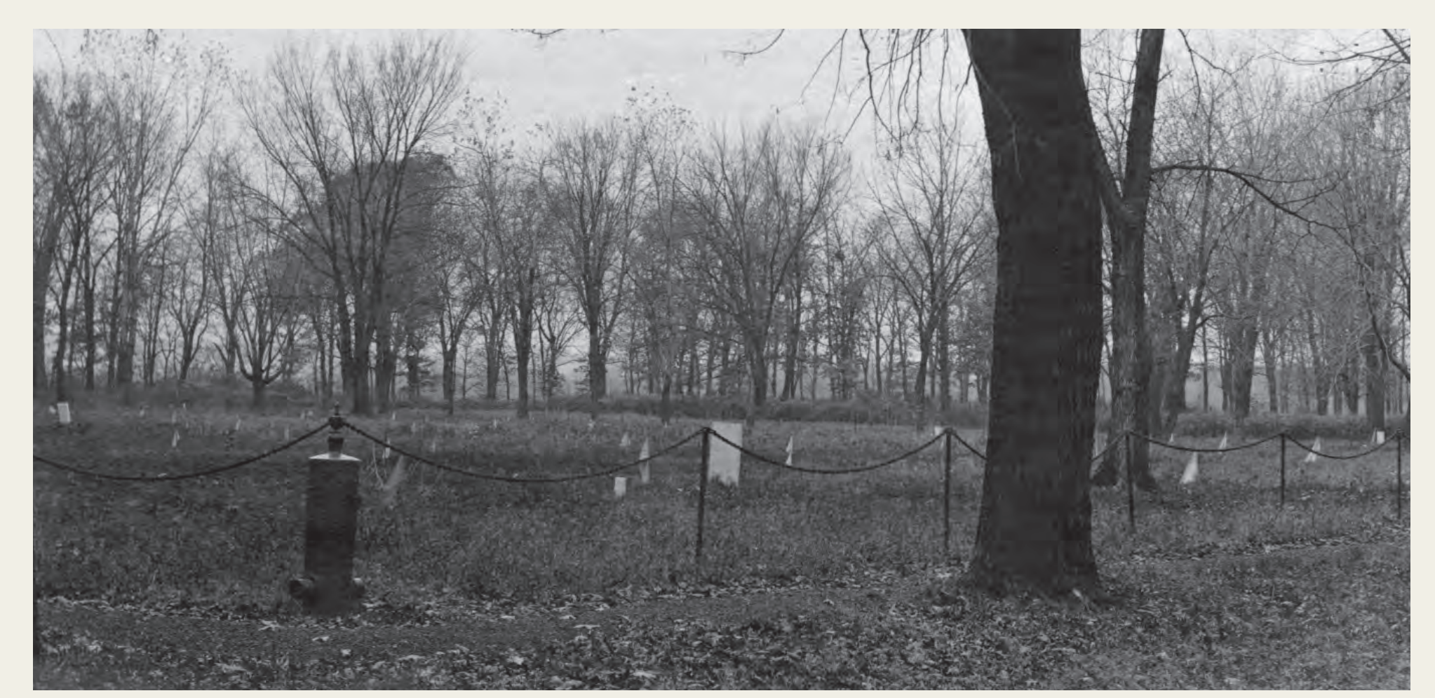
The cemetery pre-1890, with small U.S. flags on the graves.

The Commission for Marking Graves of Confederate Dead inspected the cemetery in 1907. They used Lieutenant Poland's map to identify individual graves and set pointed-top marble headstones inscribed with the name and regiment of the deceased.