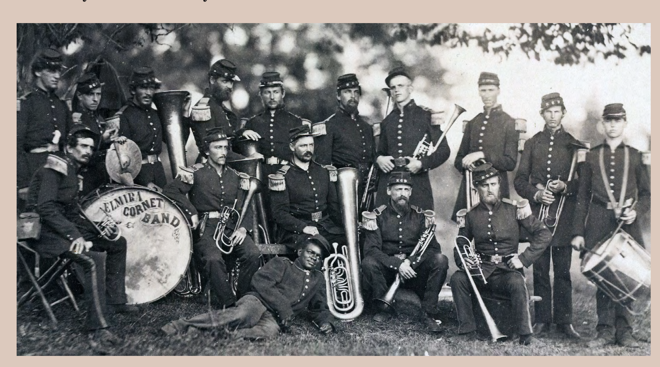
The 8th New York Militia band, some of the 20,000 men who mustered in at Elmira, c. 1861.

Located on two railroad lines and a canal, Elmira was the perfect rendezvous point for enlistees from upstate New York. Between 1861 and 1863, more than 20,000 men passed through the city on their way to the front. All three units of the army—infantry, artillery, and cavalry—were mustered in and trained at Elmira.