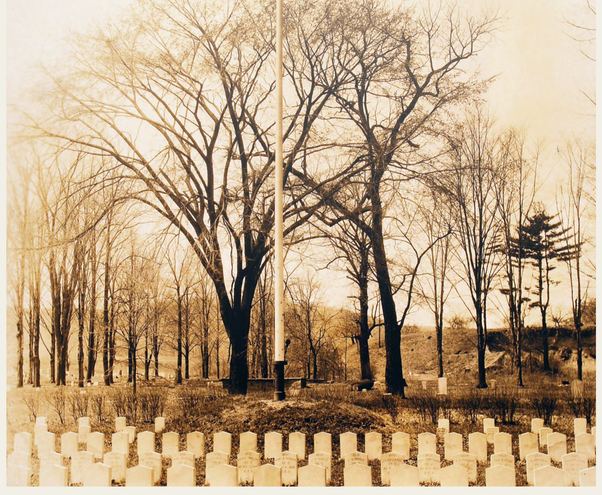
Woodlawn National Cemetery, c. 1933.

Smith also wanted the War Department to mark Confederate graves, but it refused on the basis it lacked the authority. These graves remained unmarked until 1908 when the Commission for Marking Graves of Confederate Dead completed installation of the distinctive pointed-top headstones.