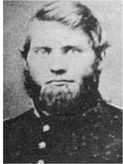
Marion Ross received the medal posthumously, c.1861.

Early on the morning of April 12, 1862, nineteen of the raiders boarded a northbound train. Two men overslept and missed their train. Upon arriving at the train station in Big Shanty to refuel, the undercover passengers disembarked for breakfast. The stop, near present-day