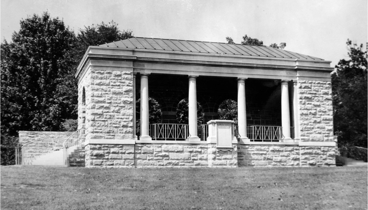
Figure 9. The rostrum at Nashville National Cemetery, Tennessee, built in 1940. This monumental rostrum, nearly identical to one built at Andersonville National Cemetery in 1941, represents the larger neoclassical speakers' stands the Construction Division of the Office of the Quartermaster General was able to build at selected cemeteries immediately prior to World War II. National Archives and Records Administration, Washington, D.C., Records of the Department of Veterans Affairs, Department of Memorial Affairs, National Cemetery Historical File (Record Group 15/A-1, entry 25), maintenance ledger pages for Nashville.