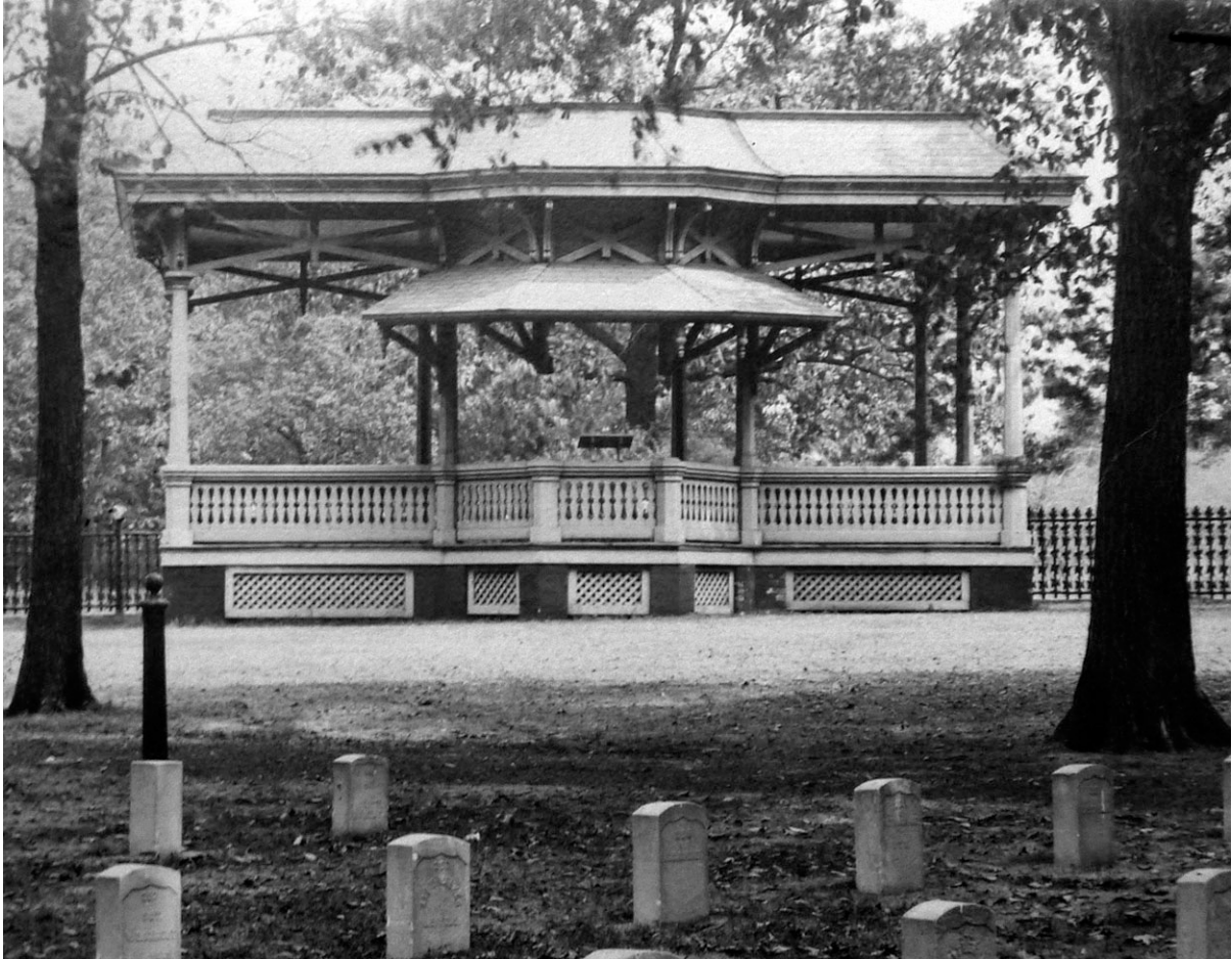
Figure 2. The rostrum at Rock Island National Cemetery, Illinois, ordered built by Secretary of War William Belknap for use during Decoration Day observances in 1875. National Archives and Records Administration, Washington, D.C., Records of the Department of Veterans Affairs, Department of Memorial Affairs, National Cemetery Historical File (Record Group 15/A-1, entry 25), maintenance ledger pages for Jefferson Barracks.