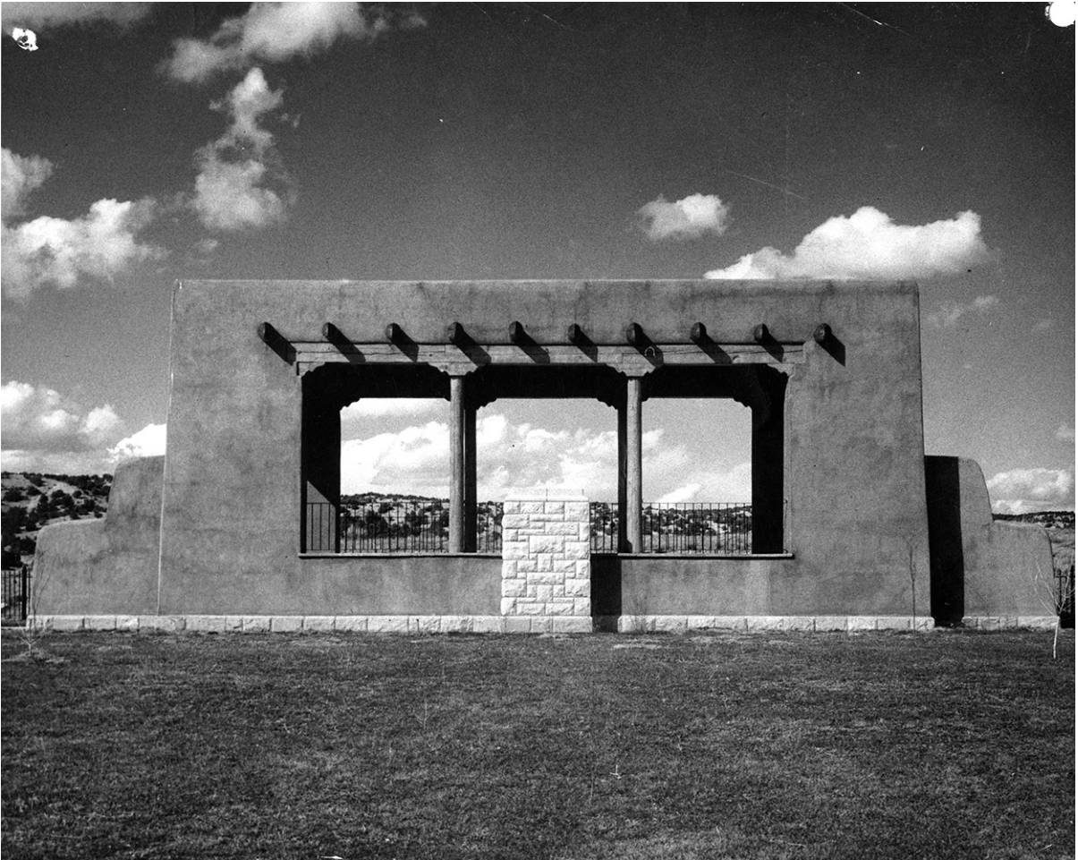
Figure 10. The rostrum at Santa Fe National Cemetery, New Mexico, designed in the Pueblo Revival style in 1939 and completed in 1942.