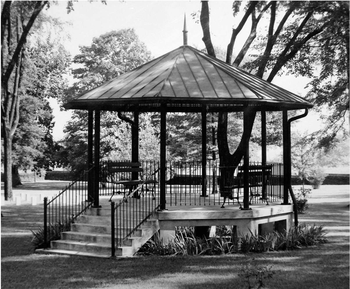
Figure 6. The rostrum at Raleigh National Cemetery, North Carolina, built to the simplified standard plan for rostrums in 1931. National Archives and Records Administration, Washington, D.C., Records of the Department of Veterans Affairs, Department of Memorial Affairs, National Cemetery Historical File (Record Group 15/A-1, entry 25), maintenance ledger pages for Raleigh.