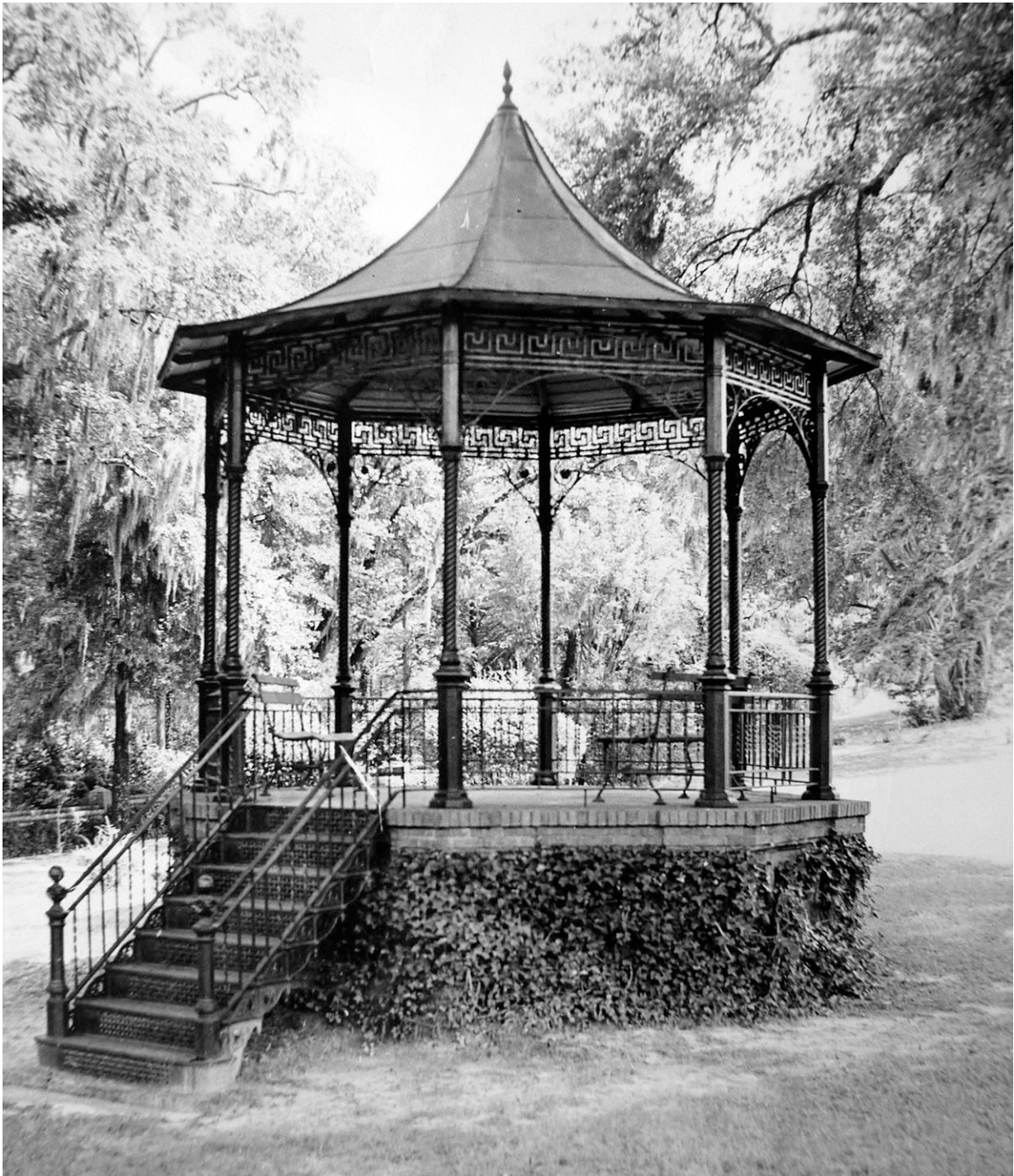
Figure 5. The standard octagonal rostrum at Wilmington National Cemetery, North Carolina, built in 1886. This is one of the first octagonal rostrums, built by the Champion Iron Fence Company of Kenton, Ohio. The sheathing over the roof framework is a later modification. This rostrum still stands, although its superstructure above the level of the handrail was removed in 1958. National Archives and Records Administration, Washington, D.C., Records of the Department of Veterans Affairs, Department of Memorial Affairs, National Cemetery Historical File (Record Group 15/A-1, entry 25), maintenance ledger pages for Wilmington.