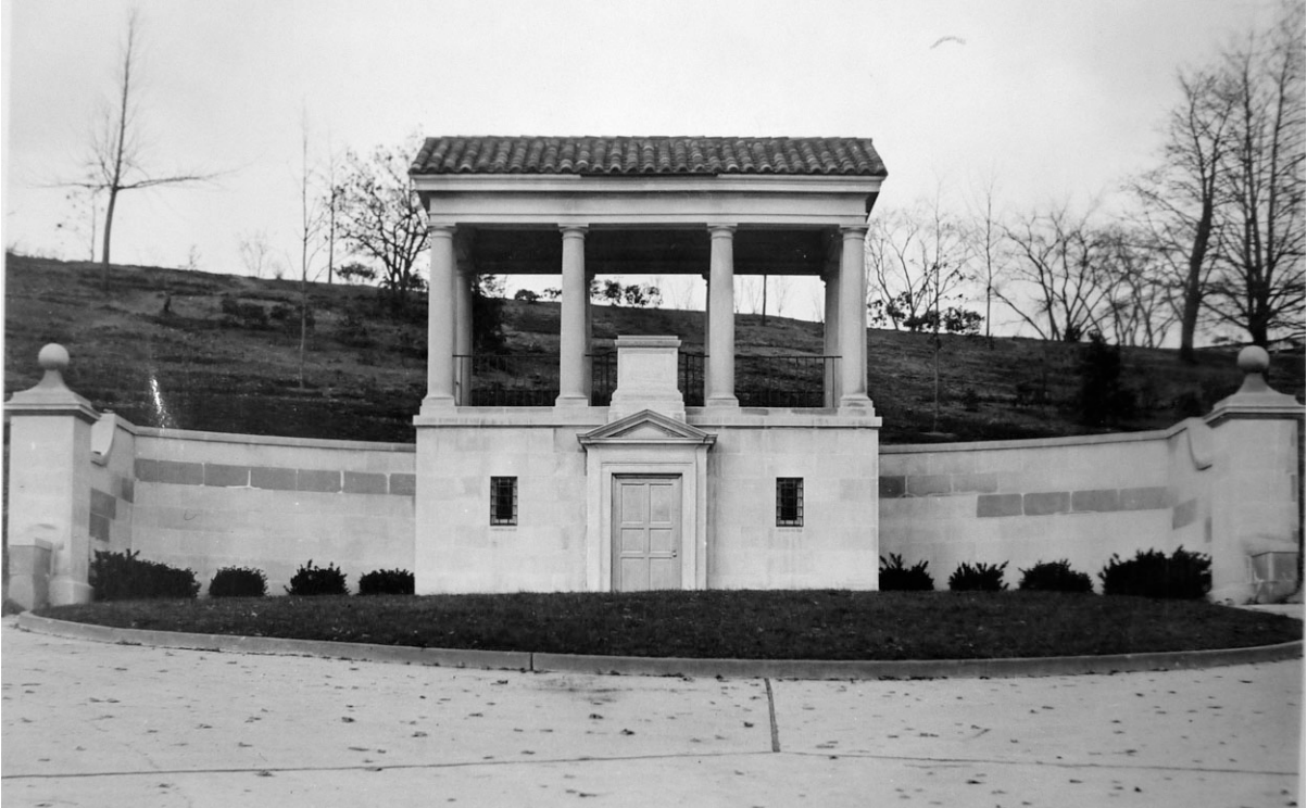
Figure 8. The rostrum at Cypress Hills National Cemetery, Brooklyn, New York, built in 1939 with a commanding view along the cemetery's axial main drive. National Archives and Records Administration, Washington, D.C., Records of the Department of Veterans Affairs, Department of Memorial Affairs, National Cemetery Historical File (Record Group 15/A-1, entry 25), maintenance ledger pages for Cypress Hills.