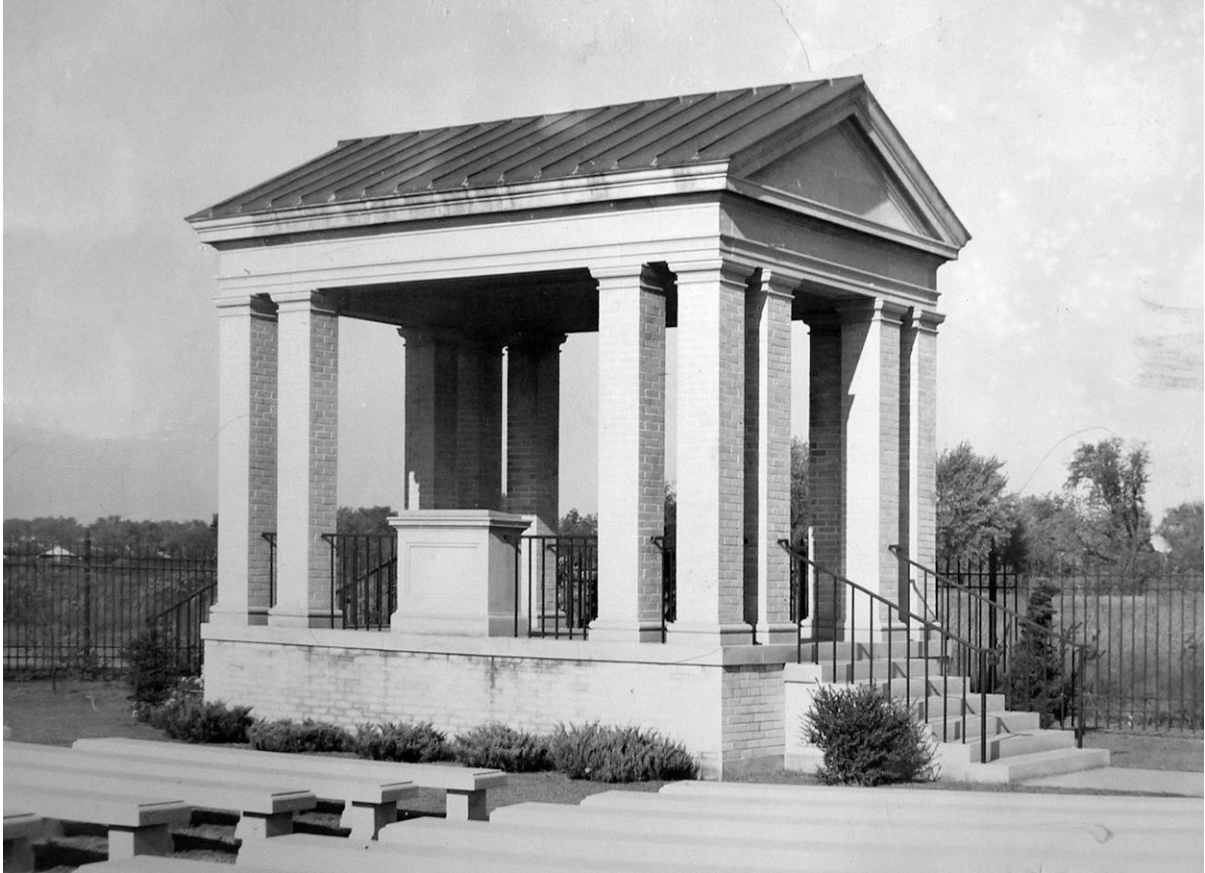
Figure 7. The small neoclassical rostrum at Beverly National Cemetery, New Jersey, built in 1937. A nearly identical rostrum was built of limestone at Camp Butler National Cemetery, Illinois, in 1939. National Archives and Records Administration, Washington, D.C., Records of the Department of Veterans Affairs, Department of Memorial Affairs, National Cemetery Historical File (Record Group 15/A-1, entry 25), maintenance ledger pages for Beverly.