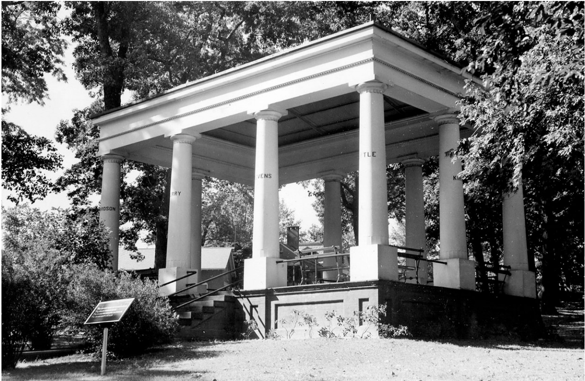
Figure 4. The rostrum at Soldiers' Home National Cemetery, D.C., completed in 1883. The design was adapted from the standard design for rectangular rostrums and made use of ten sandstone columns and matching entablature blocks salvaged from the south exhibition room of the Patent Office Building after a fire in 1877. Additional salvaged columns and blocks were used to build a monumental gateway for this cemetery and a Temple of Fame at Arlington National Cemetery.