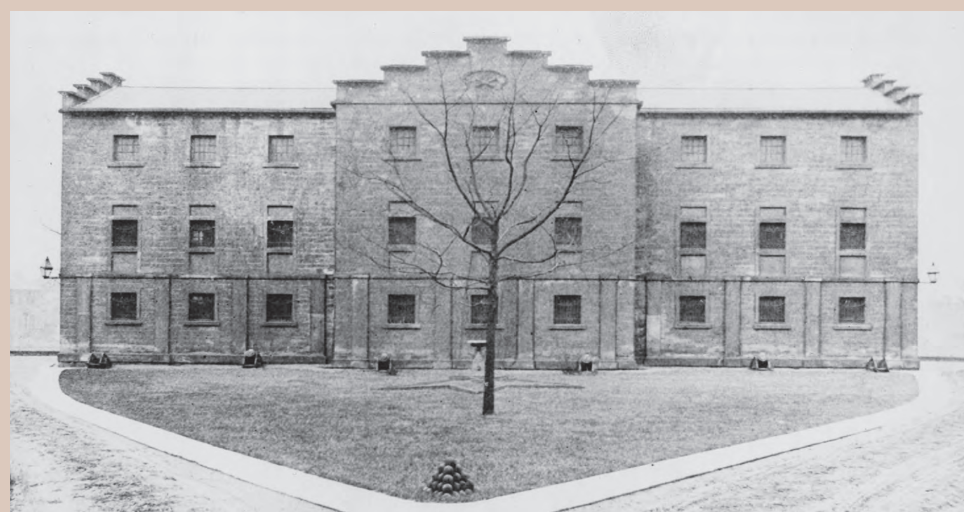
Allegheny Arsenal, in Pittsburgh’s Lawrenceville neighborhood, manufactured cartridges and other ammunition for the Union. An explosion on September 12, 1862—the same day as the Battle of Antietam, Maryland—killed 78 workers, most young women. Many were buried together at Allegheny Cemetery.

Pittsburgh rallied for the war effort. In fall 1861, citizens formed a subsistence committee. Members served more than 400,000 meals to soldiers who passed through the city. Mercy Hospital, established in 1847 by the Sisters of Mercy, a Roman Catholic order of nuns, filled with sick and wounded soldiers. Overcrowding at Mercy led the federal government to establish a military hospital in 1862 at West Pennsylvania Hospital.