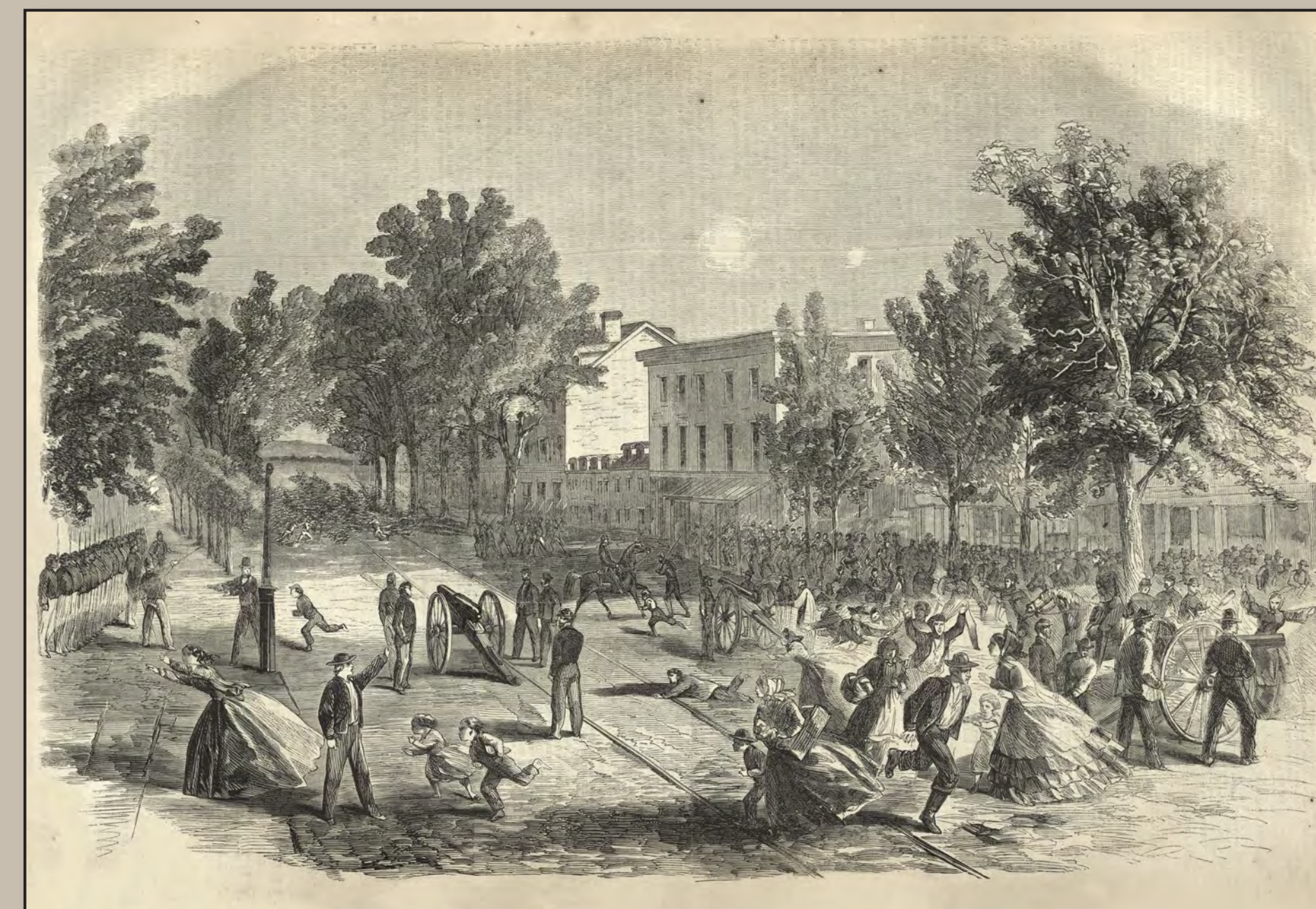
Confederate forces attack Carlisle. Harper’s Weekly Magazine (July 25, 1863).

On July 1, Union forces set up artillery in Carlisle. When Confederate forces arrived and demanded their surrender, they declined. The Confederates burned Carlisle Barracks that night and departed. After the Battle of Gettysburg, 50 miles to the south, buildings at Dickenson College and many others in town served as temporary hospitals.