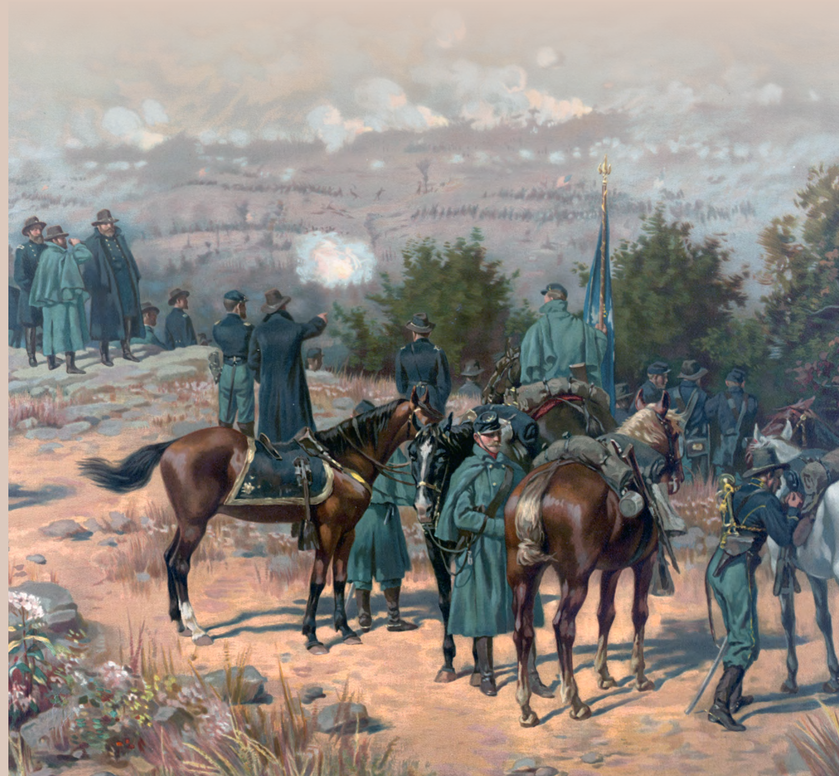
The Battle of Chattanooga, L. Prang & Co., 1880.