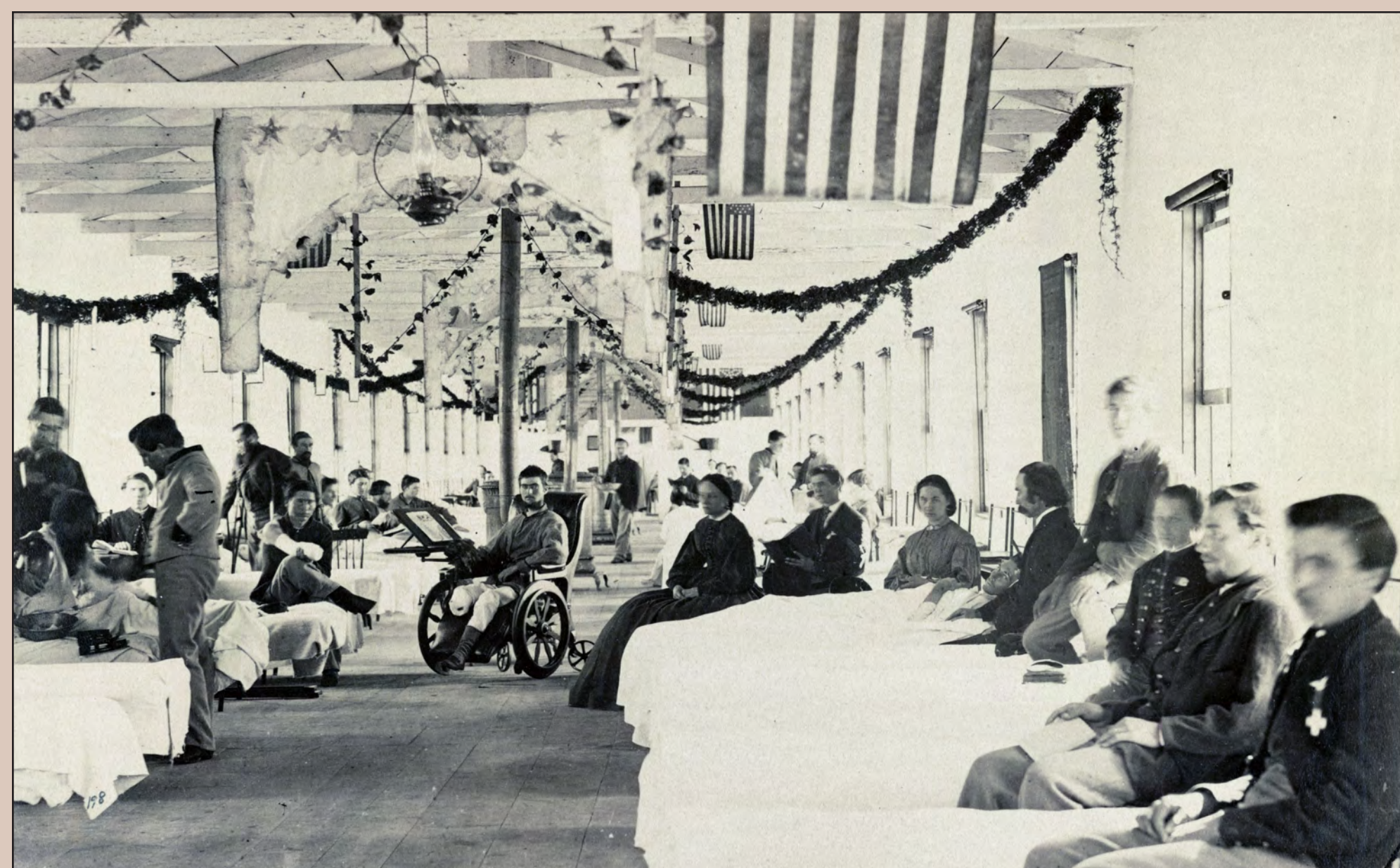
A ward in Armory Square Hospital, Washington, D.C., c. 1863.

Washington City's population skyrocketed when 30,000 fugitive slaves arrived in search of freedom and opportunity. When the Compensated Emancipation Act became law on April 16, 1862, it became the first emancipated city in America. Thousands of freedmen enlisted here and served in the U.S. Colored Troops.