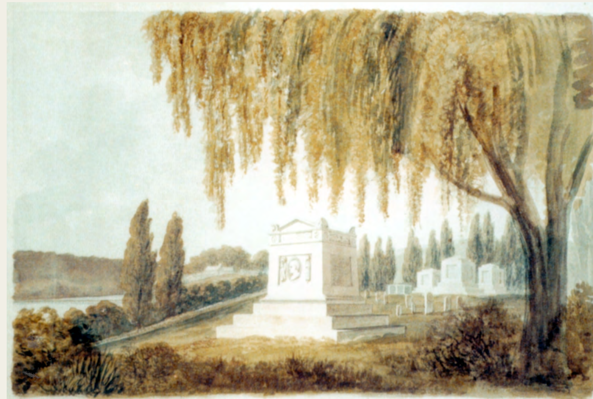
Watercolor of Congressional Cemetery by Benjamin Latrobe, c. 1812. Considered America's first architect, Latrobe is credited with the cenotaph design seen here. Originally painted white, the geometrical memorial markers were constructed from Aquia sandstone.