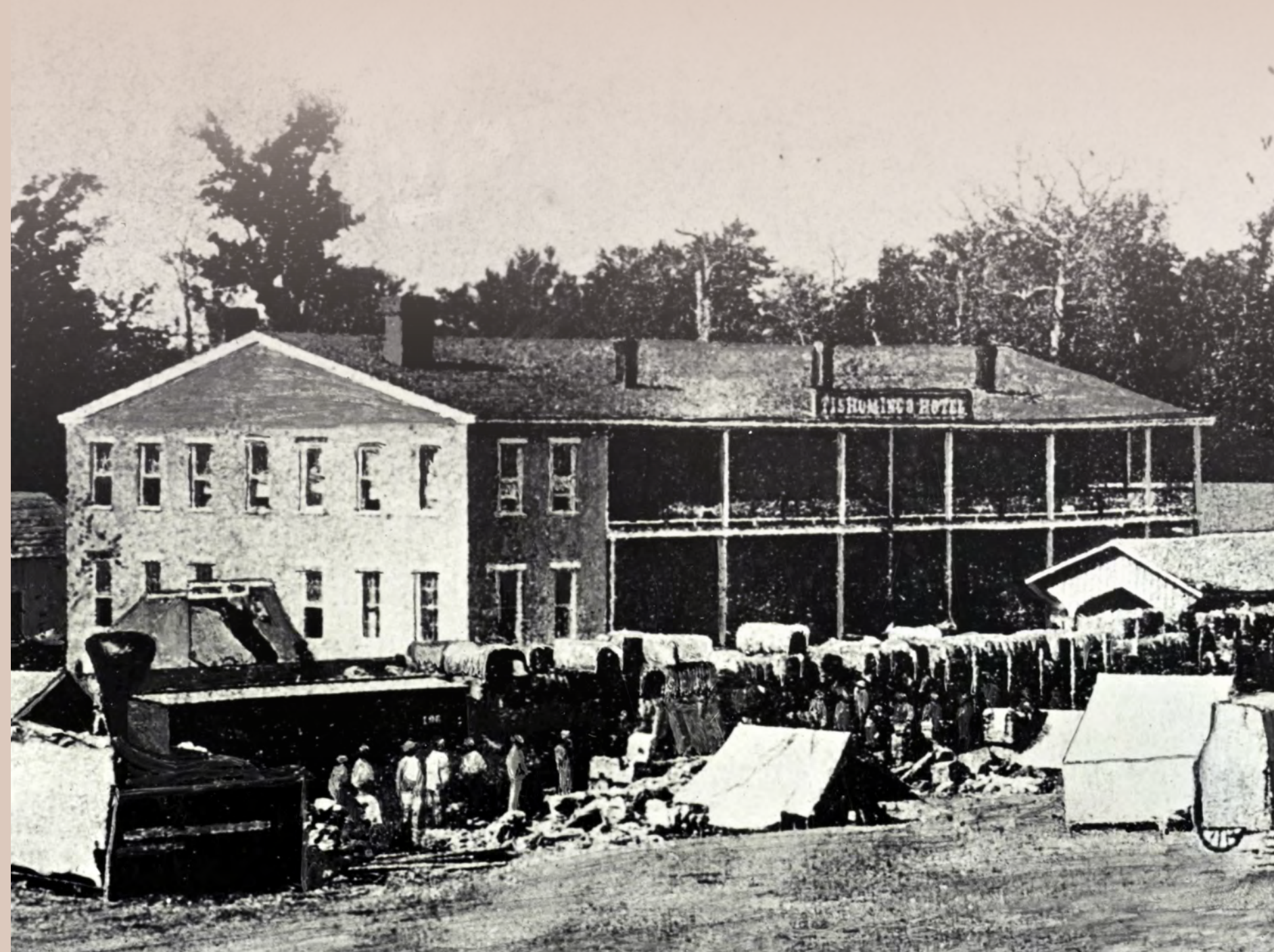
Union soldiers and supplies at the Corinth railroad depot, c. 1862. Library of Congress.