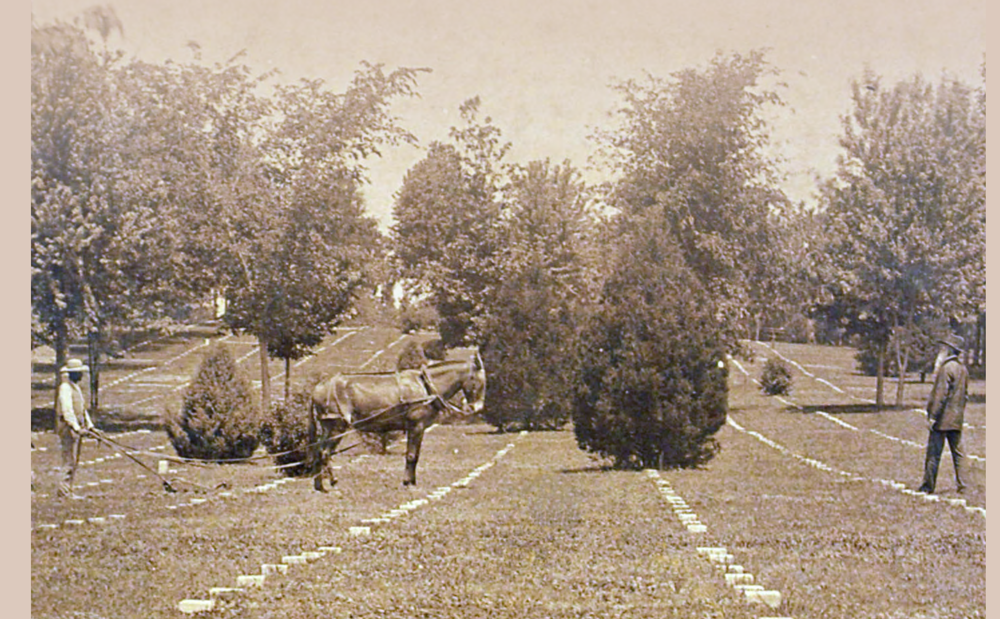
Groundskeeping among unknown grave markers at Corinth, 1892.

In the 1870s, the U.S. Army placed marble headstones on the graves, and erected a brick lodge for the superintendent. The lodge was replaced in 1934.