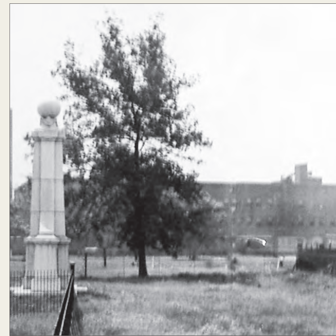
Monument at Greenlawn Cemetery, 1910.

In 1906, when the Commission for Marking Graves of Confederate Dead visited Greenlawn Cemetery, it discovered some burials had been moved and the land converted into a city park. As individual graves could not be identified, a single monument was authorized for the site. Van Amringe Granite Company of Boston, Massachusetts, completed the impressive monument in 1909. Bronze plaques listed the names of 1,616 Confederate dead.