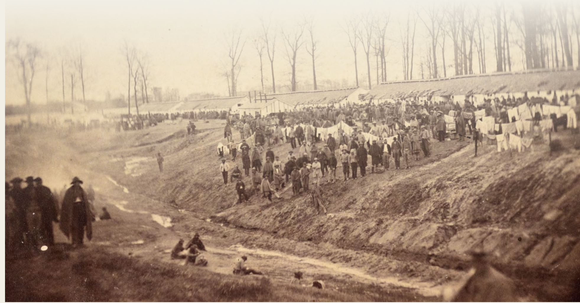
Confederate prisoners at Camp Morton, c. 1864.