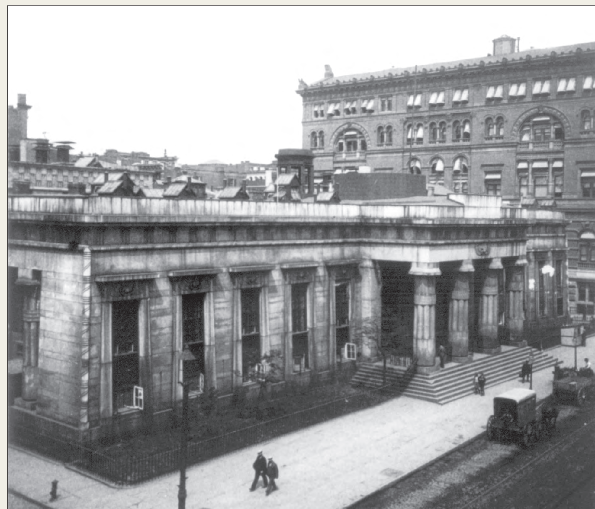
The Toombs Prison complex occupied an entire city block in lower Manhattan, c. 1896.

Prison facilities including the Toombs, Bedloe's (Liberty) Island, Hart's Island, Fort Lafayette, Governors Island, Fort Schuyler, Riker's Island, Fort Columbus, and Castle Williams all held Confederate soldiers. De Camp General Hospital on David's Island, though not a prison, treated thousands of Confederates wounded at the Battle of Gettysburg. The Hart's Island facility was the last established and the largest of New York City's prisons. At no time during its short operation, April to July 1865, did it hold fewer than 3,000 prisoners.