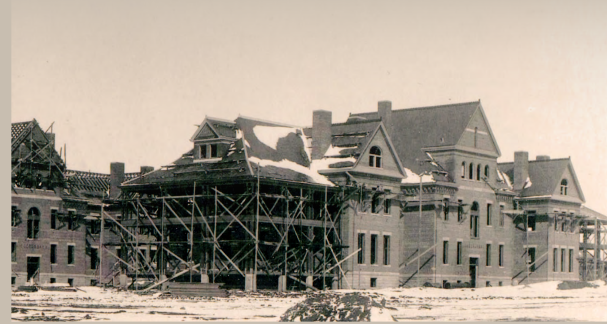
National Home barracks under construction, March 1898.

The home's sprawling 325-acre campus included every facility that aging veterans might require. The men lived in barracks and dined in a mess hall. Protestant and Catholic chapels served spiritual needs. The sick were treated in a hospital.