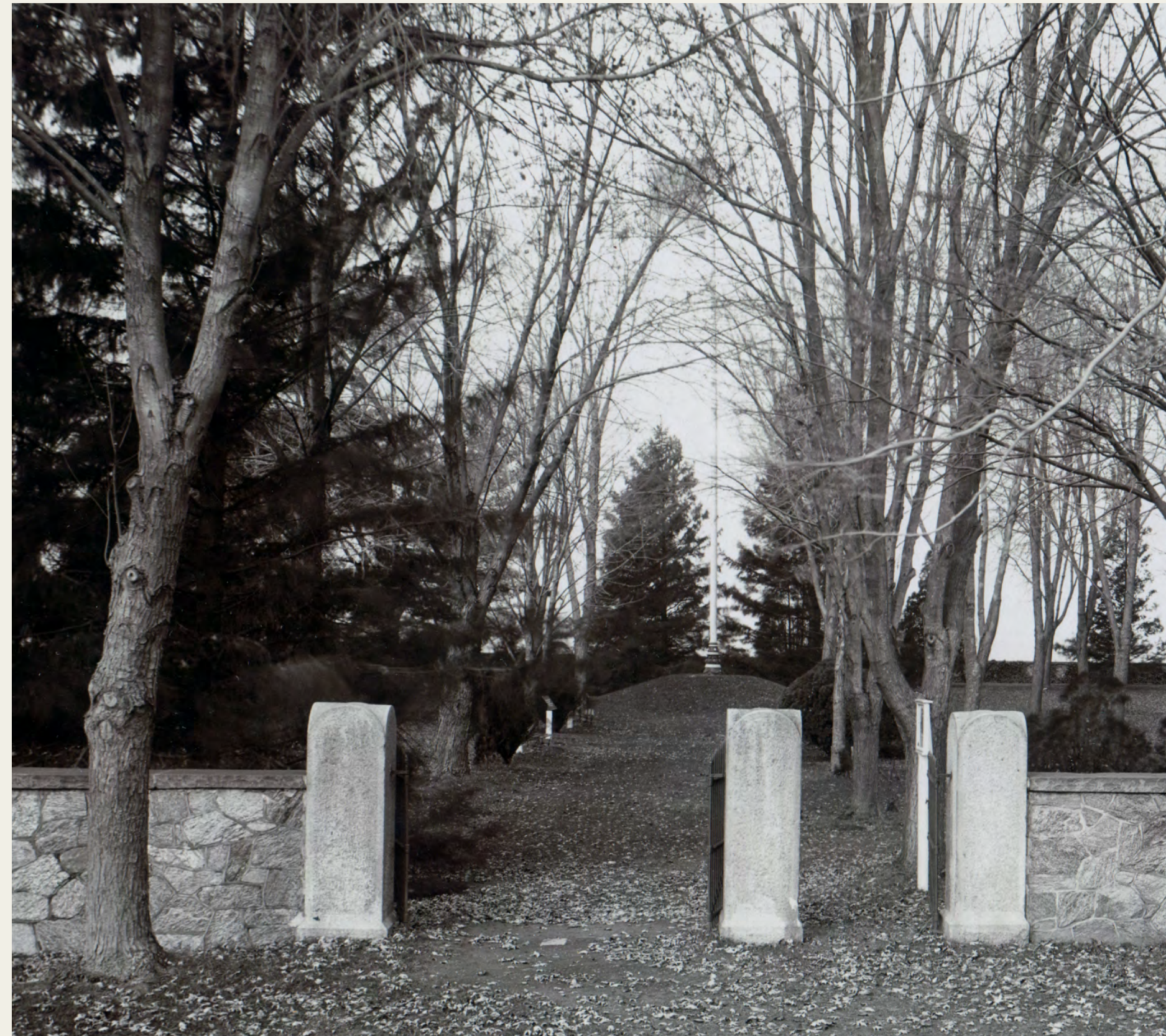
The wall and gate in 1903.

Union soldiers, many of whom were prison guards, died at Fort Delaware. They were buried in a post cemetery established outside the fort walls on Pea Patch Island.