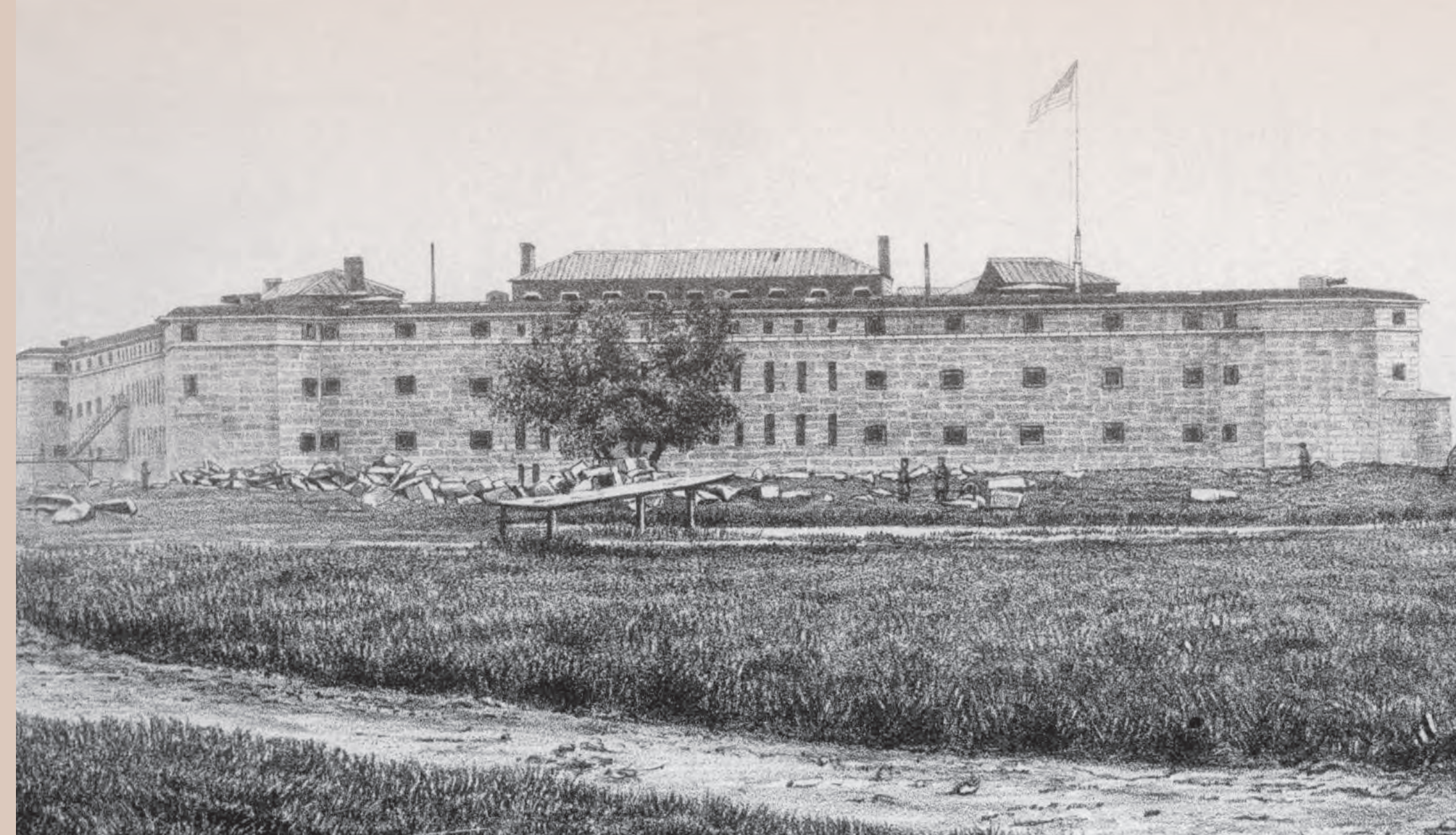
Fort Delaware, from sheet music "Sounds of Fort Delaware," 1864.

In July 1861, eight Confederate prisoners of war arrived at the fort. It served as a prison for the rest of the war.