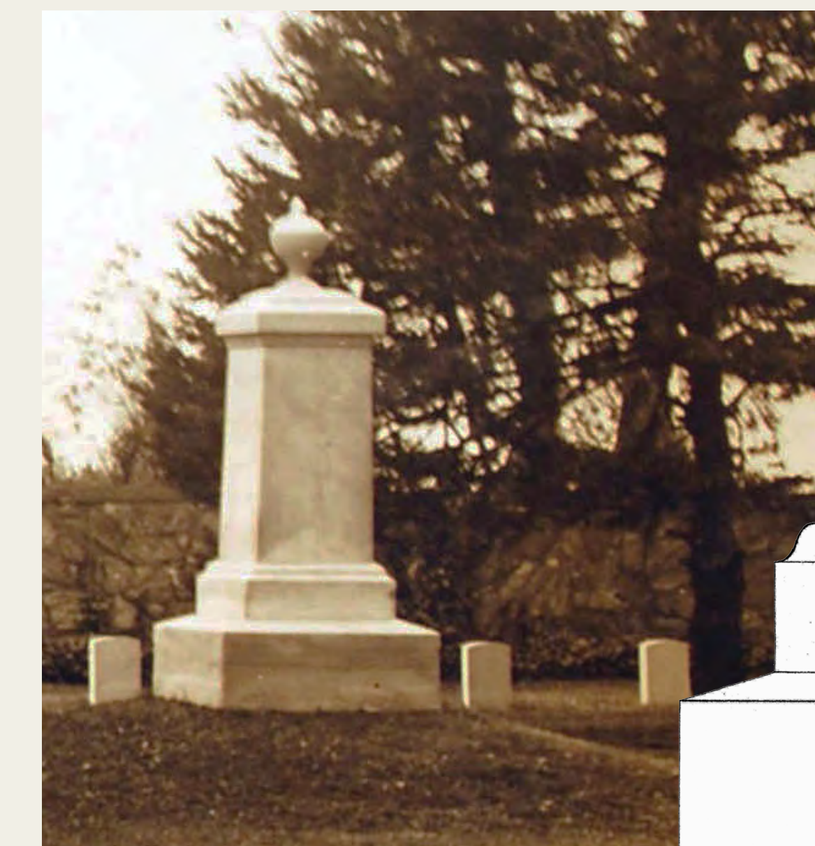
The Union Monument, 1933 (above), and concept drawing signed by Quartermaster General Montgomery C. Meigs (right).

The 4.5-acre cemetery was enclosed by a stone wall in the 1880s. Cast-iron tablets bearing stanzas of the poem "Bivouac of the Dead" were also placed on the grounds.