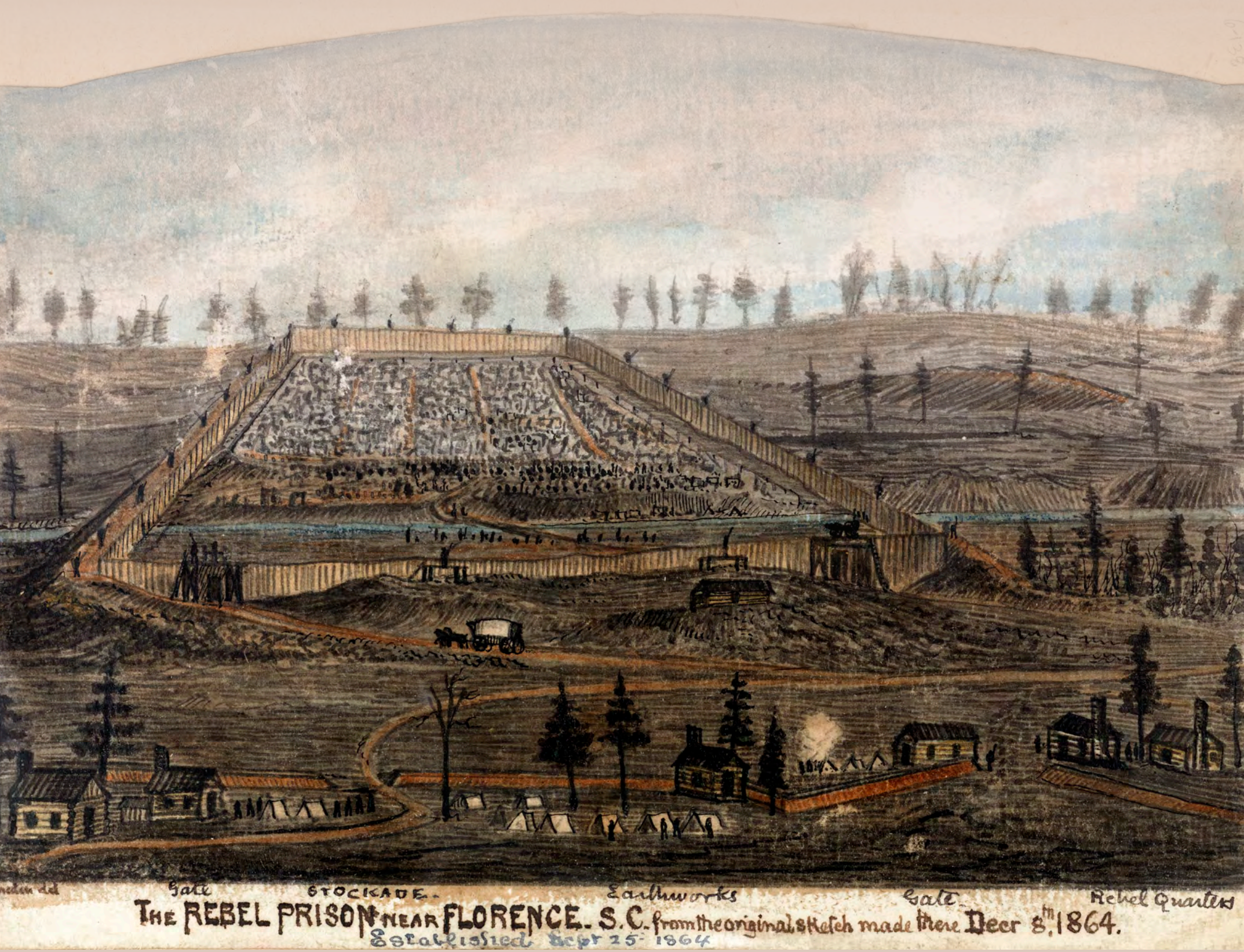
Florence Military Prison, 1864

[The dead] were piled one upon another until the wagon was filled. A party of prisoners was at work every day digging trenches where the bodies of the dead soldiers were to be laid.