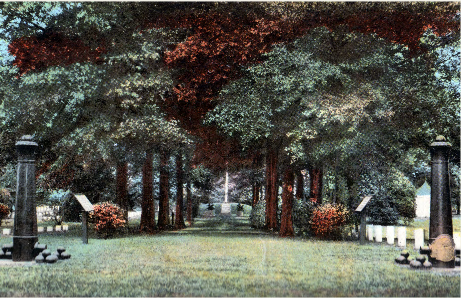
Postcard view of cemetery, c. 1923.