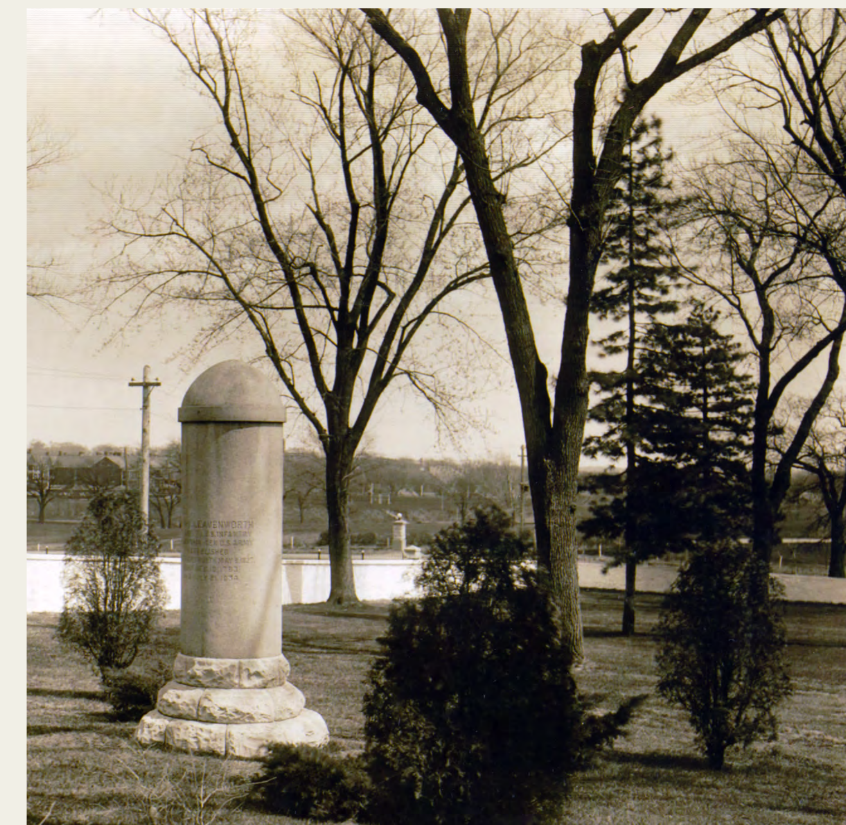
Colonel Leavenworth's grave marker, 1933, before the eagle was added to the top in 1956.

The graves of two noted soldiers are marked by private headstones. Colonel Leavenworth, who died in 1834 in Indian Territory (Oklahoma), was originally buried in New York. His remains were moved here in 1902 and marked with a granite shaft (Section 2, Grave 3215). Col. Edward Hatch enlisted in the volunteer army during the Civil War and later served in the Regular Army (Section A-OFF, Grave 2204). Men of the all-black 9th U.S. Cavalry who served under Hatch during the Indian Wars funded his granite pedestal-style marker.