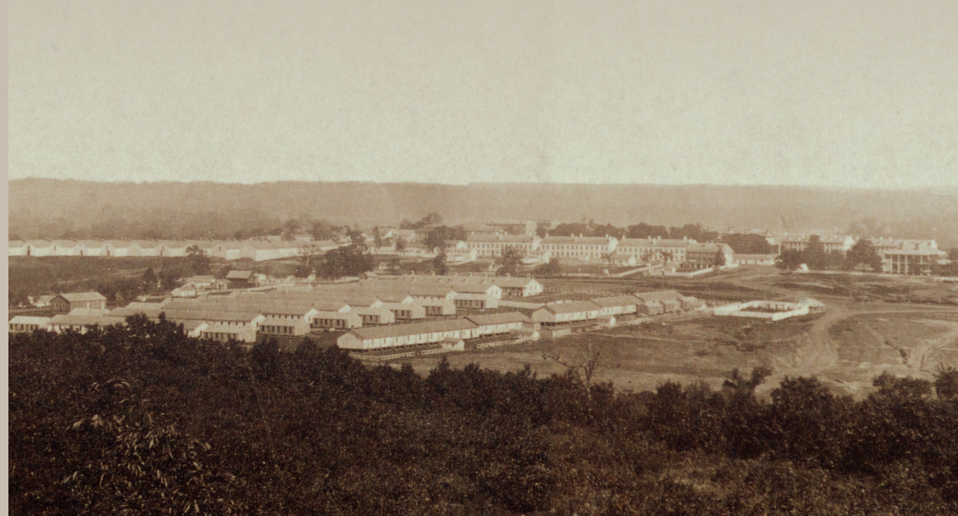
Fort Leavenworth, 1867.