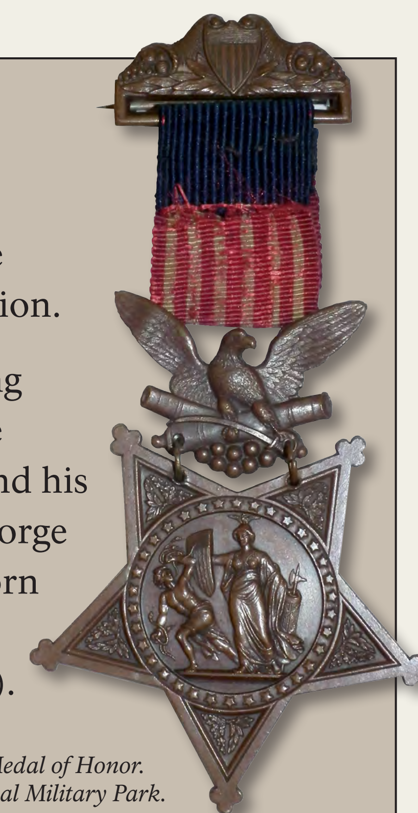
Civil War Army Medal of Honor. Gettysburg National Military Park.