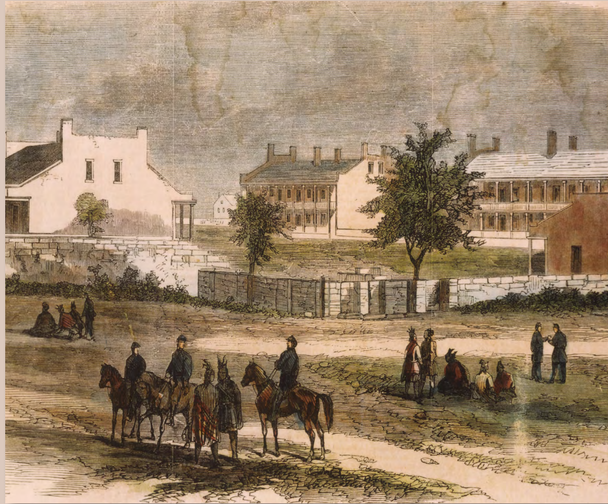
Fort Smith, 1865.