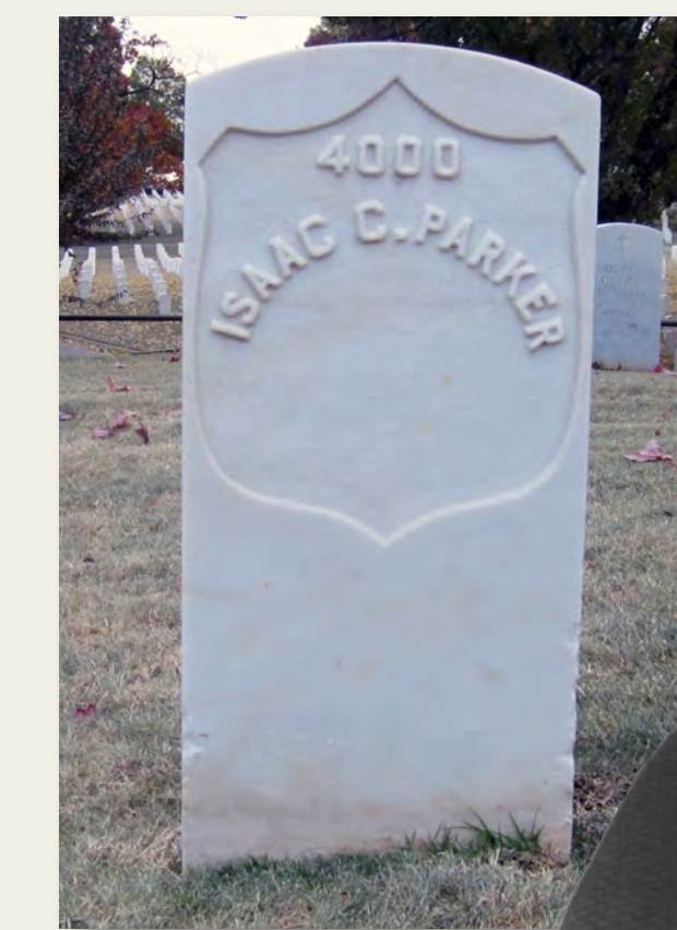
Isaac C. Parker, c. 1875.

Isaac Charles Parker was born on October 15, 1838, in Ohio. In 1859, he became a lawyer and moved to St. Joseph, Missouri. Parker resigned from his position as city attorney in 1861 to join the Union Army. After the Civil War, he was elected county prosecutor and later served two terms in the U.S. Congress. On March 18, 1875, President Ulysses S. Grant appointed him judge of the Western District of Arkansas, based in Fort Smith.