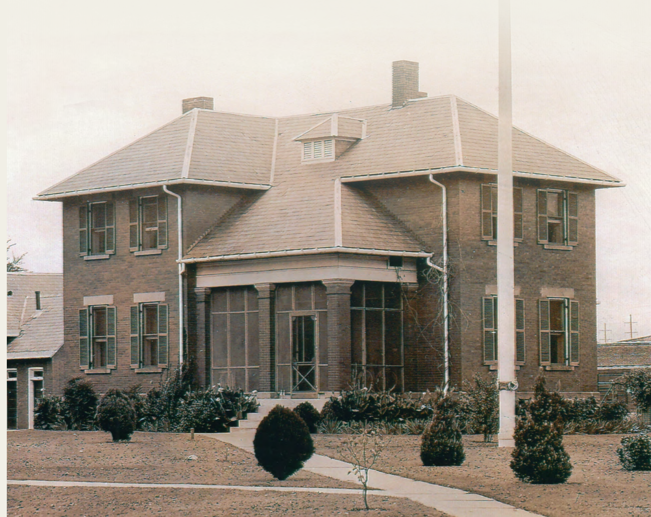
The lodge in 1941.

In the 1870s, the U.S. Army Quartermaster General's Office constructed a brick lodge and wall, and placed permanent marble headstones on the graves. In 1898, a tornado swept through Fort Smith and caused extensive damage. The wall was rebuilt in stone, and the lodge was replaced with the current two-story building in 1904. When a new entrance was erected in 1942, the old iron gates were moved into the cemetery. Over the years, the cemetery has expanded to more than 32 acres.