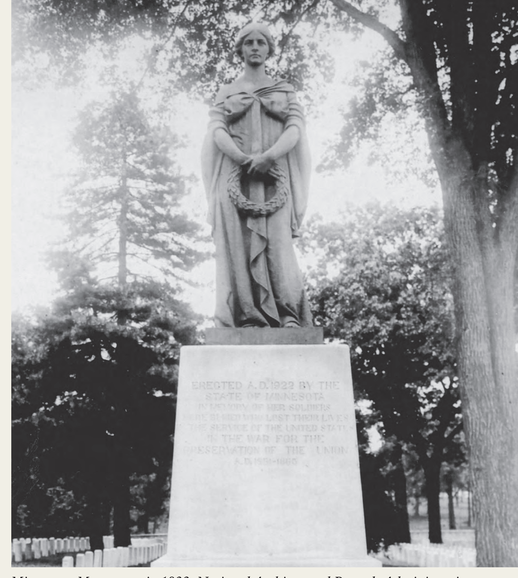
Minnesota Monument in 1933.